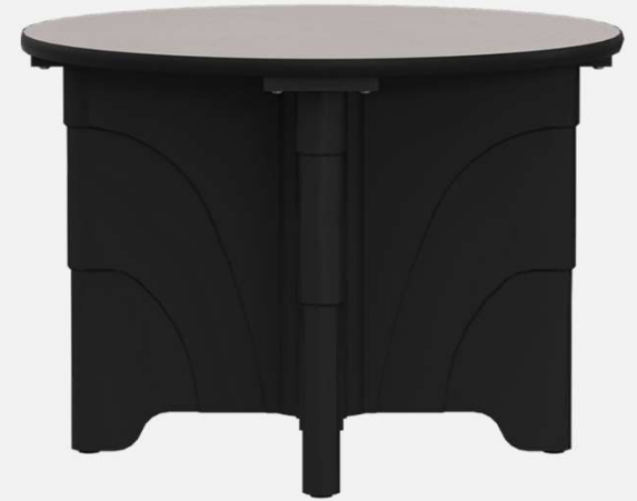
5005-42R-HPL 42" diameter x 30"