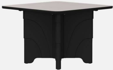
5005-42S 42" x 42" Plain Top