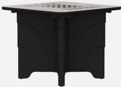
5005-36S 36" x 36" Game Top