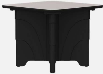
5005-36S 36" x 36" Plain Top