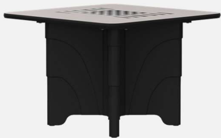
5005-42S 42" x 42" Game Top