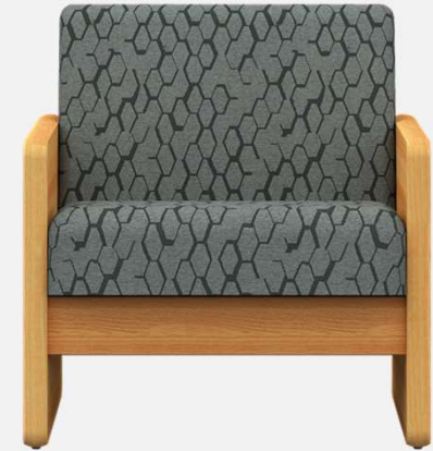
RS01 CHAIR 33”d x 27”w x 28.5”h 16” Seat Height 21.5” Arm Height