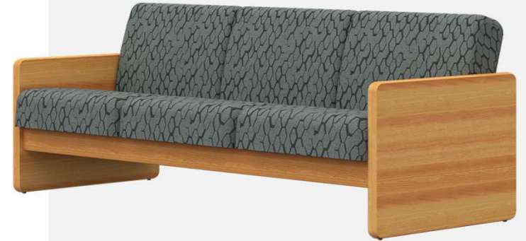
RS03 3 SEAT SOFA 33''d x 74''w x 28.5''h