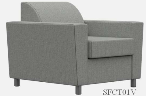
SFCT01V 36" d x 36" w x 32" h 17.5" Seat Height 24" Arm Height