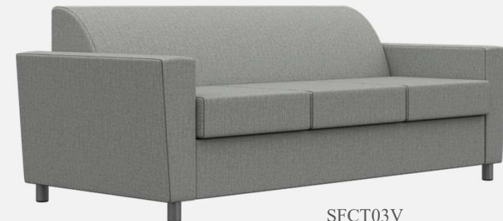
SFCT03V 36" d x 82" w x 32" h 17.5" Seat Height 24" Arm Height