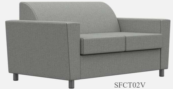
SFCT02V 36" d x 59" w x 32" h 17.5" Seat Height 24" Arm Height