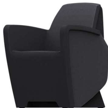
Black - 901