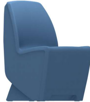
Slate Blue - 426