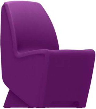
Grape - 360