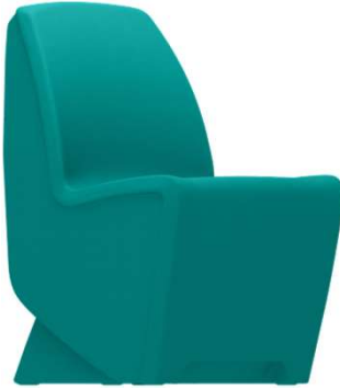
Surf - 445