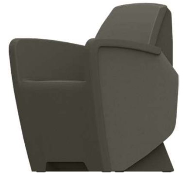
Shade - 902