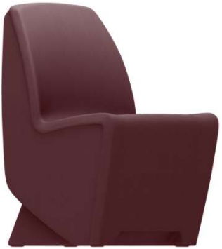
Burgundy - 318