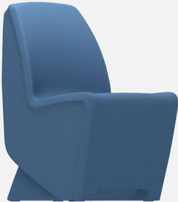
Armless Chair 50-701 25”d x 21”w x 33”h