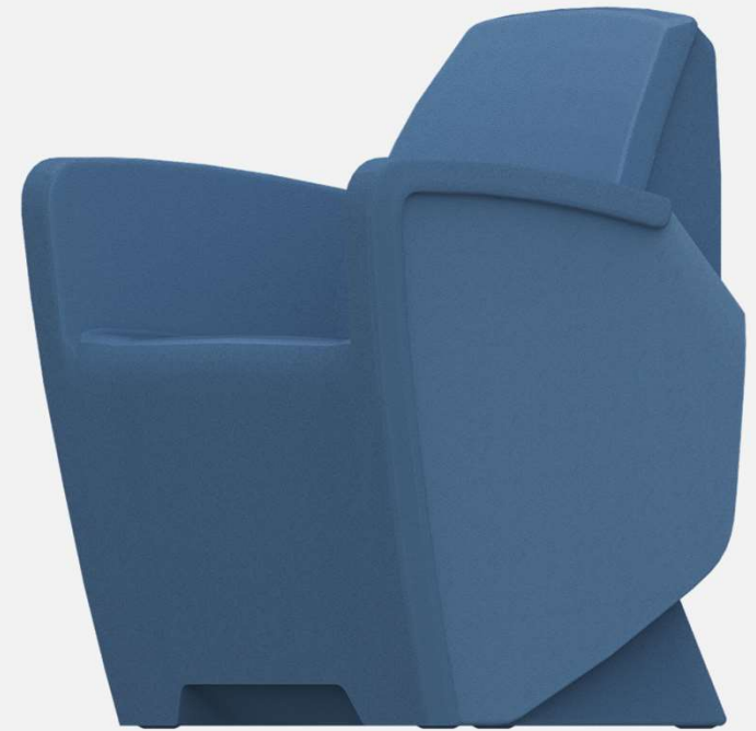
Armchair 50-702 25”d x 24”w x 33”h 26” Arm Height

NOTE: Heavy-strength, industrial plastic bags should be used to contain ballasting material when adding weight to chairs (not included). Once filled, end should be securely tied off.