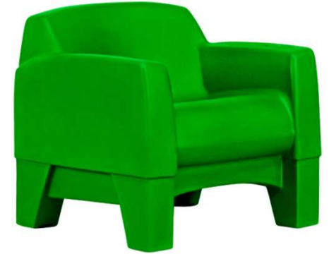
Celtic - 525