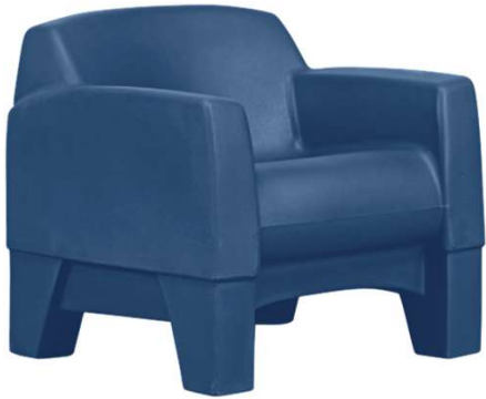
Slate Blue - 426