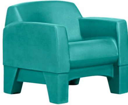
Surf - 445