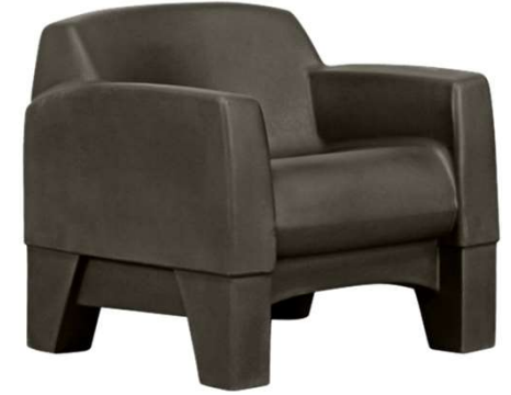
Shade - 902