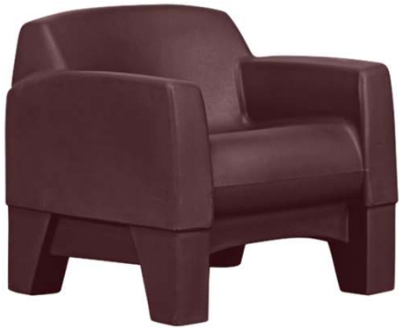
Burgundy - 318