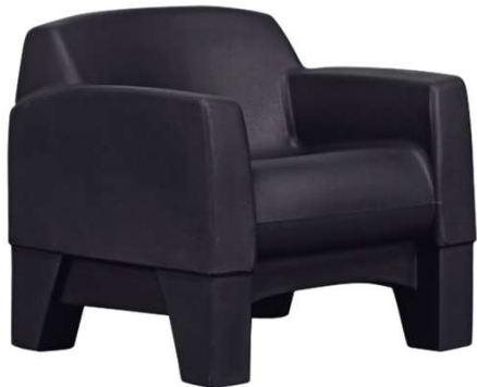
Black - 901