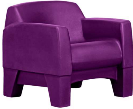
Grape - 360