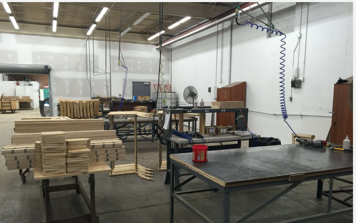
Frames assembled with interlocking components and reinforced utilizing high-grade commercial quality adhesive and galvanized coated framing fasteners

All seams stitched with finest quality bonded, low profile nylon thread. Superior strength and abrasion resistance