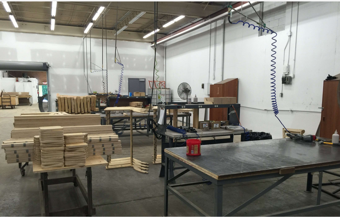
Frames assembled with interlocking components and reinforced utilizing high-grade commercial quality adhesive and galvanized coated framing fasteners