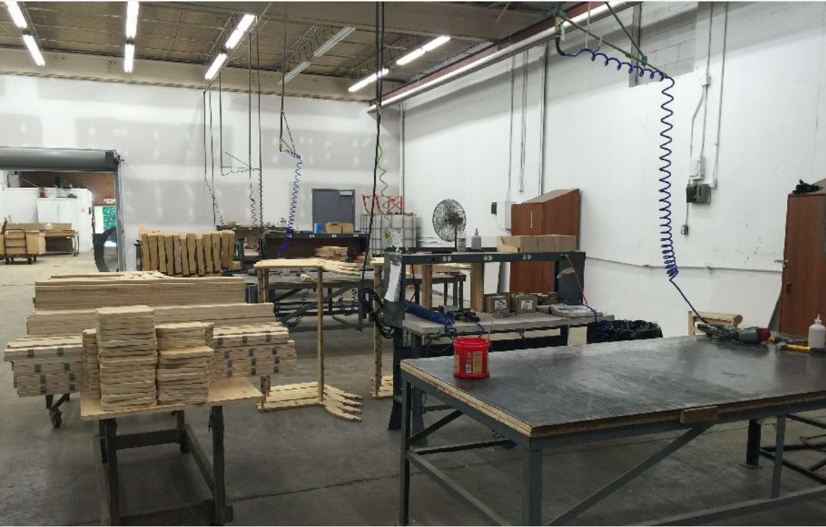
Frames assembled with interlocking components and reinforced utilizing high-grade commercial quality adhesive and galvanized coated framing fasteners