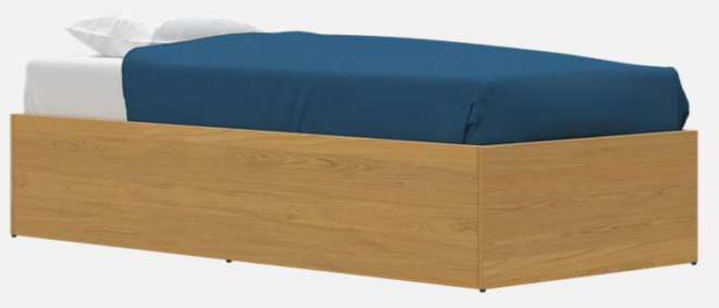
FR9C 37.5"d x 81.5"w x 15.5"h 14" Deck Height