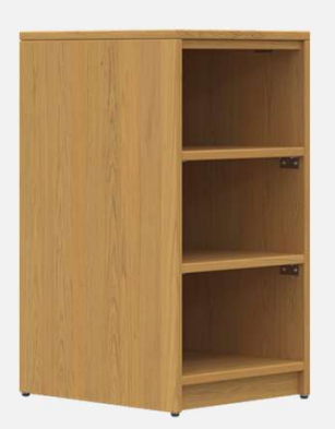
FR5-3O 18"d x 15.75"w x 30"h