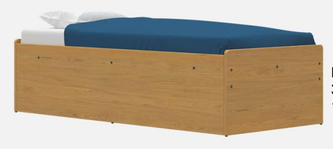
FR9SF 37.5"d x 82"w x 20.75"h 18" Deck Height