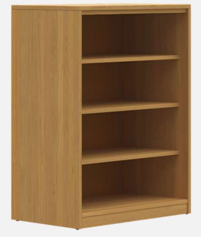
FR4B 24"d x 30"w x 40"h