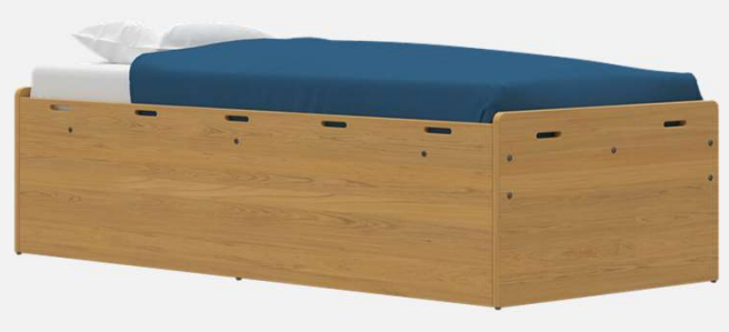
FR9SF-R 37.5"d x 82"w x 20.75"h 18" Deck Height