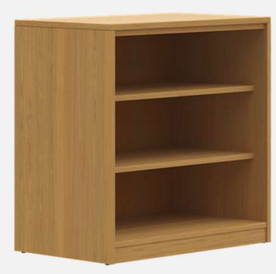
FR4A 24"d x 30"w x 30"h