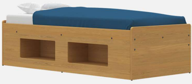
FR9SF-CUB 37.5"d x 82"w x 20.75"h 18" Deck Height