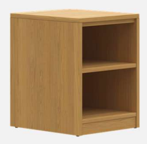
TFR-20 18"d x 15.75"w x 21"h