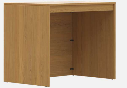
TR4A 24"d x 30"w x 30"h