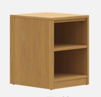
TR5-20 18"d x 15.75"w x 21"h