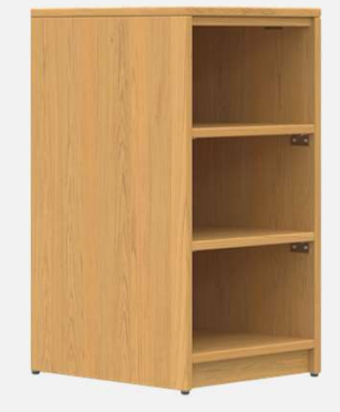
TR5-30 18"d x 15.75"w x 30"h