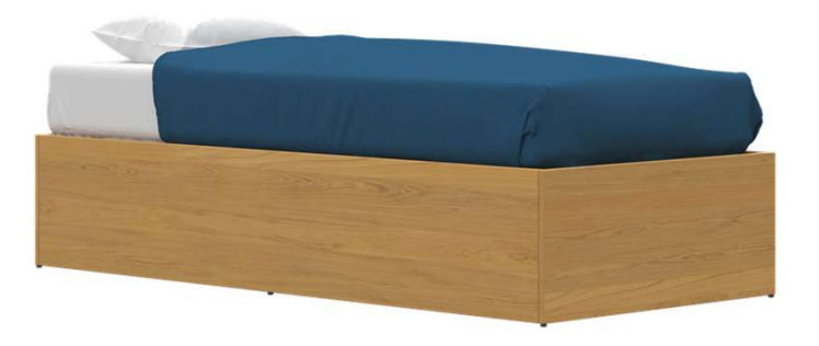
TR9C Conventional 37.5"d x 81.5"w x 16.25"h 14" Deck Height