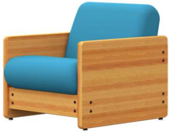
Sky - 210