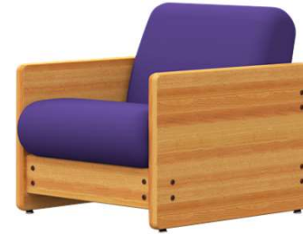
Plum - 215