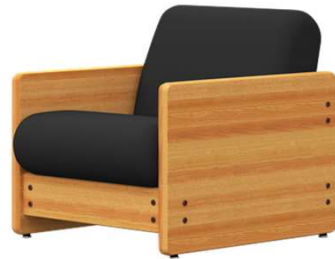
Black - 901