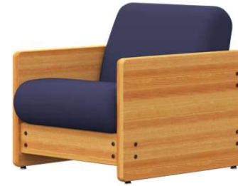
Huckleberry - 403