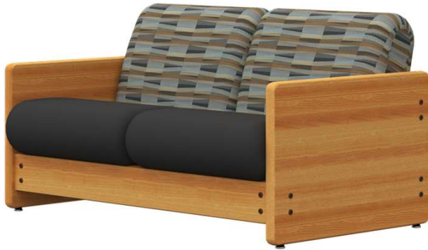
810-02-1 Square Back Cushions