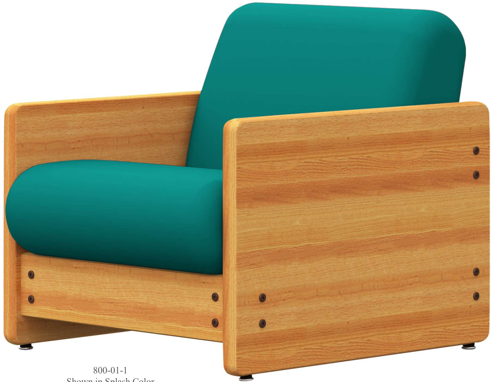
800-01-1 Shown in Splash Color