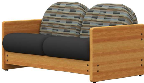
810-02-3 Fully Rounded Back Cushions