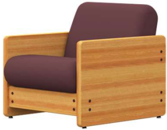
Burgundy - 318