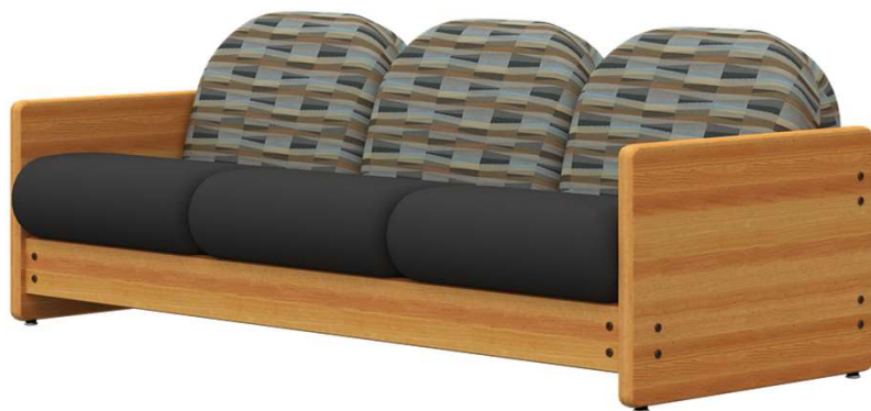
800-03-3 Fully Rounded Back Cushions