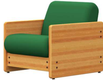
Leaf - 220