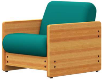
Splash - 225