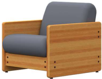
Flannel Grey - 845