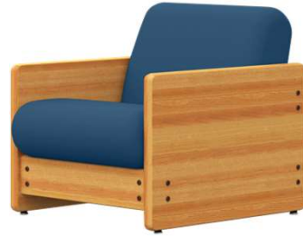
Slate Blue - 426