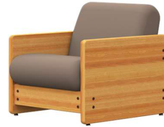
Sandstream - 700