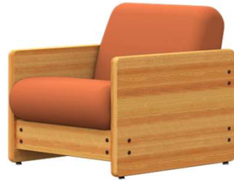
Canyon - 230