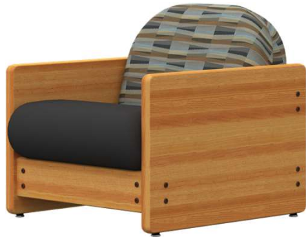
800-01-3 Fully Rounded Back Cushion