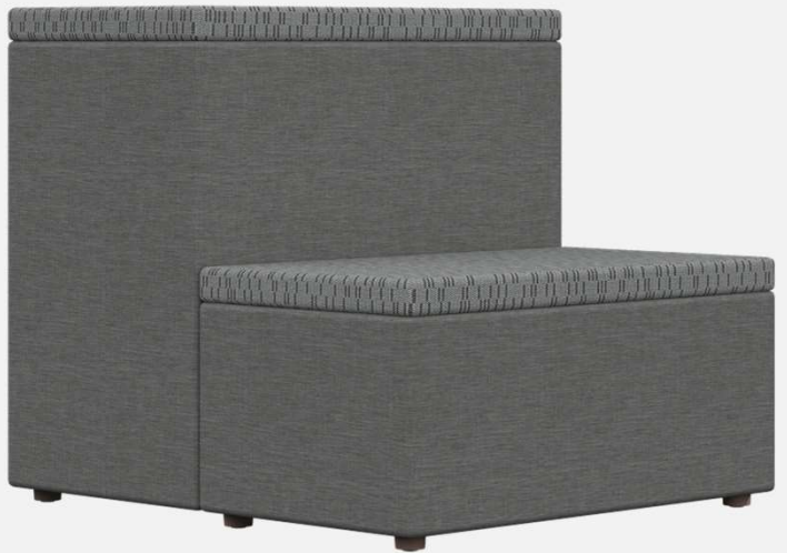
CL3TS 36”w x 40”d x 34.5”h