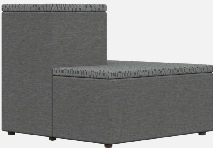
CLCRNSOUT 40”w x 40”d x 34.5”h