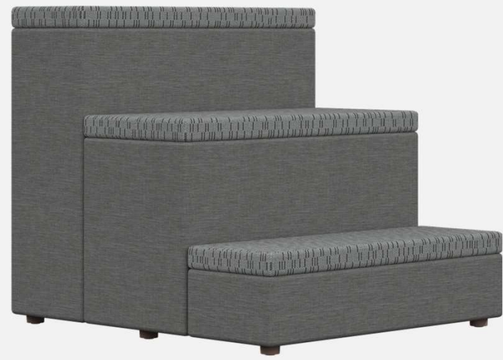
CL02 36”w x 40”d x 34.5”h