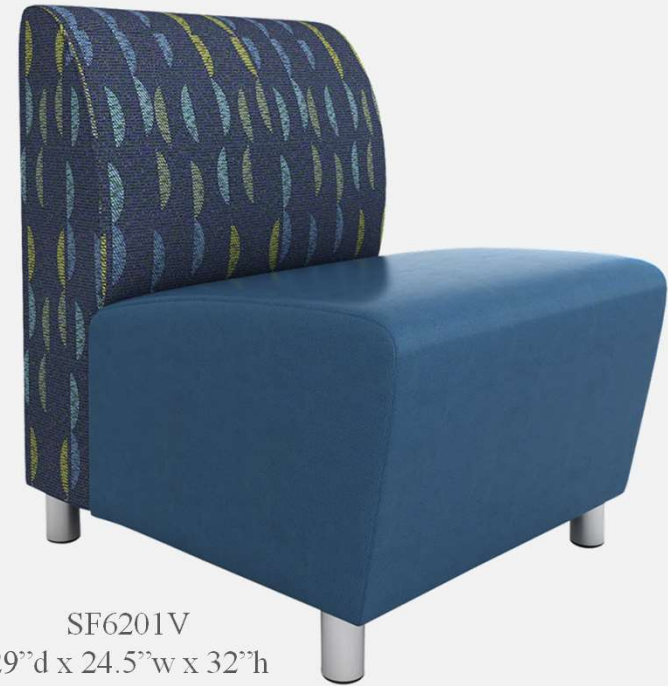
SF6201V 29" d x 24.5" w x 32" h 18" Seat Height