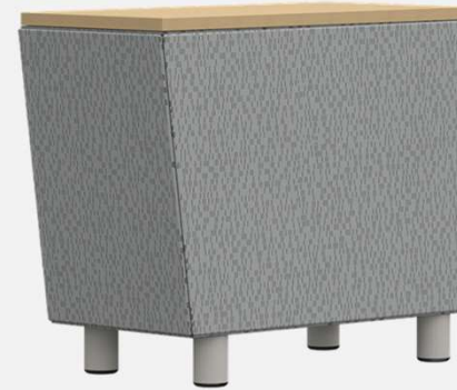
Chelsea: Lamp Table