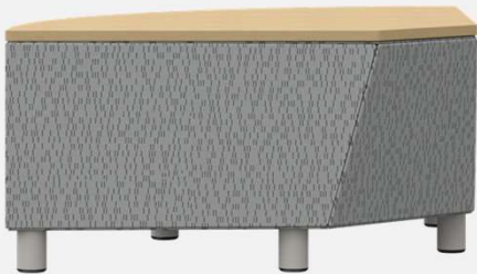
Chelsea: 90° Corner Table