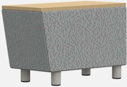
Chelsea: End Table