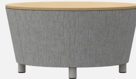
Chelsea: 36'' dia Table