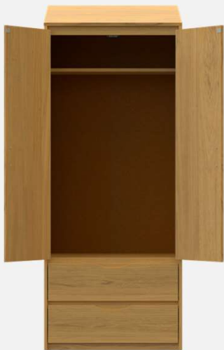
2 Door & Drawer Wardrobe Hat Shelf & Suspension System ZE6C230 23" d x 30" w x 78" h