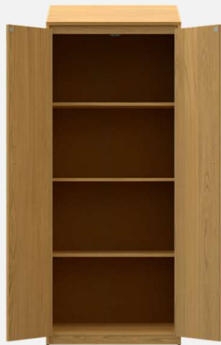
2 Door Wardrobe Fixed Shelves Only ZE6B30-3V 23" d x 30" w x 78" h