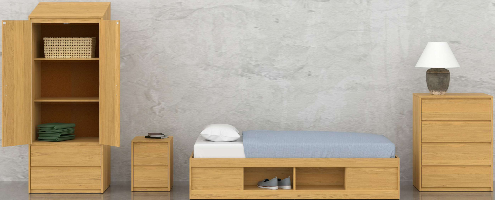
Shown with Transitions Cubby Bed (TR9C-CUB)