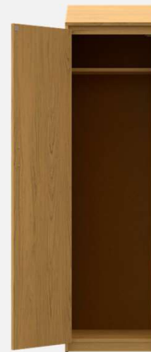
1 Door Wardrobe Hat Shelf & Suspension System ZE6B20-1DL 23" d x 20" w x 78" h