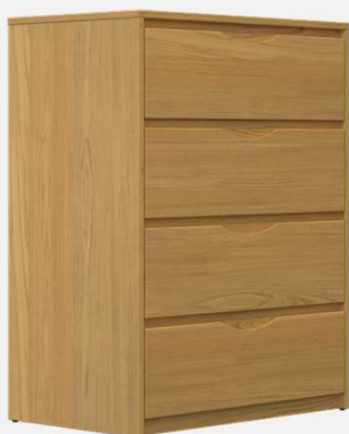
4 Drawer Dresser ZE4B-18 18" d x 30" w x 39" h