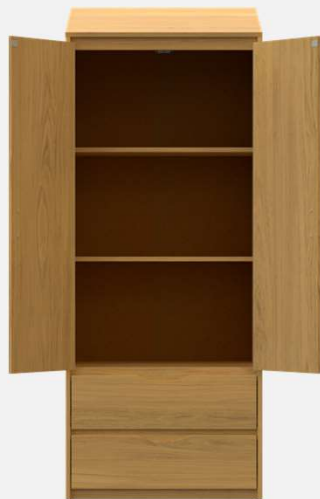
2 Door & Drawer Wardrobe Fixed Shelves Only ZE6C230-2V 23" d x 30" w x 78" h