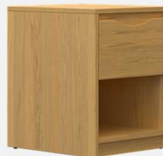
1 Drawer Nightstand ZE5A-1D 18" d x 15.25" w x 20.5" h