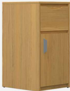
1 Drawer & Door Nightstand ZE5B-DD 18" d x 15.25" w x 30" h