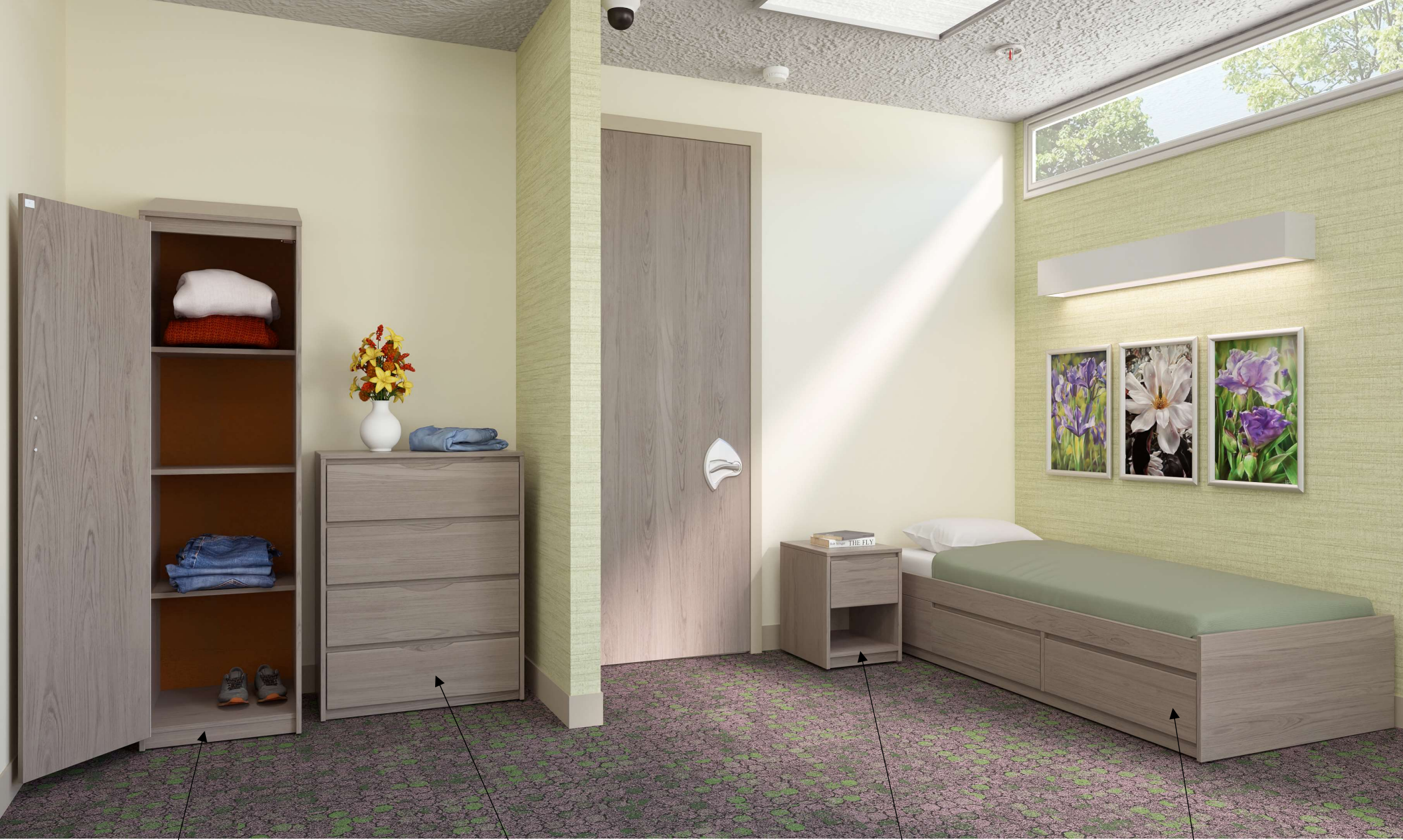
ZE6B20-1DL-3V | Wardrobe 23''d x 20''w x 78''h