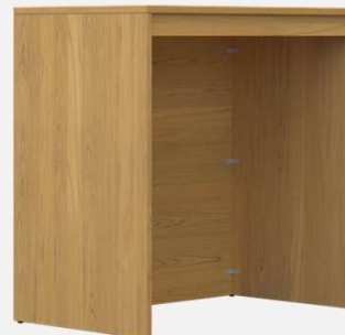
Writing Desk ZE3ZNP-FMP 18" d x 30" w x 30" h