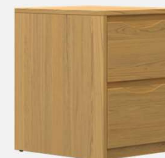
2 Drawer Nightstand ZE5A-2D 18" d x 15.25" w x 20.5" h