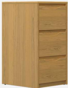
3 Drawer Nightstand ZE5B-3D 18" d x 15.25" w x 30" h