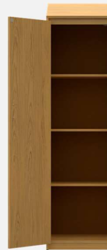
1 Door Wardrobe Fixed Shelves Only ZE6B20-1DL 23" d x 20" w x 78" h