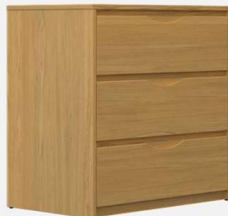
3 Drawer Dresser ZE4A-18 18" d x 30" w x 30" h