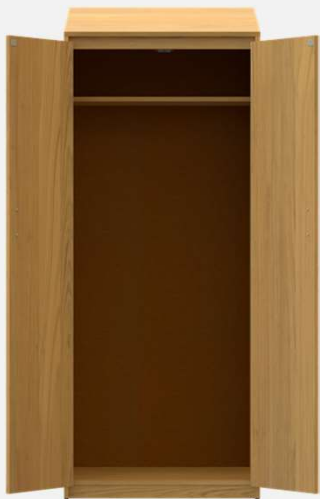
2 Door Wardrobe Hat Shelf & Suspension System ZE6B30 23" d x 30" w x 78" h