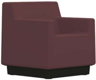
Burgundy - 318