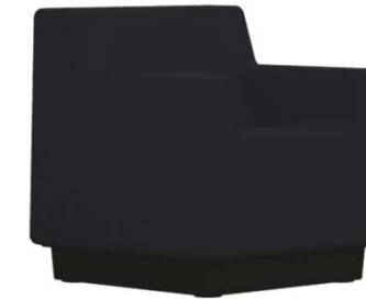
Black - 901