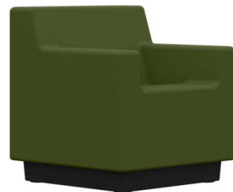
Olive - 570