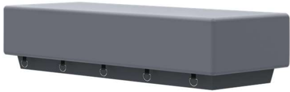
Flannel Grey - 845