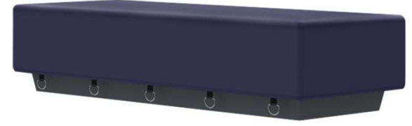
Huckleberry - 403