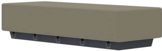
Fieldstone - 740