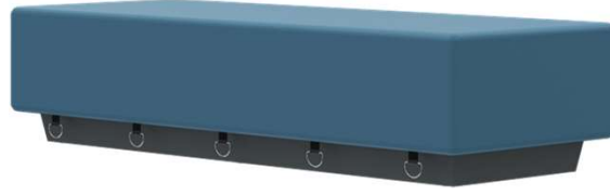
Slate Blue - 426