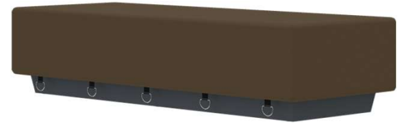
Cocoa - 704