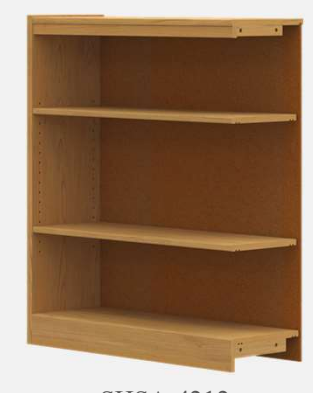
SHSA-4212 Single Face Adder 12" x 36"w x 42"h