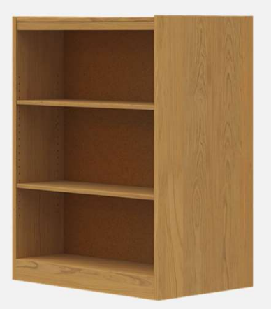
SHDS-4824 Double Face Starter 24" x 37"w x 48"h