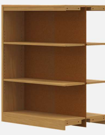
SHDA-4824 Double Face Adder 24" x 36"w x 48"h

ModuForm recommends wall anchoring single face shelving to prevent tipping