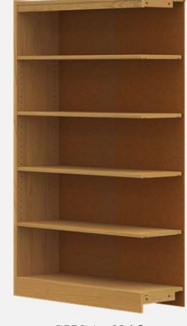
SHSA-6012 Single Face | Adder 12" x 36"w x 60"h