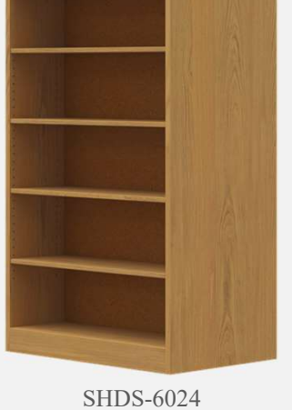
SHDS-6024 Double Face | Starter 24" x 37"w x 60"h