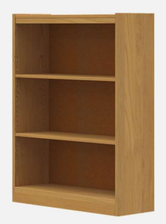
SHSS-4812 Single Face Starter 12" x 37"w x 48"h