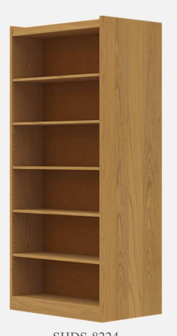
SHDS-8224 Double Face | Starter 24" x 37"w x 82"h