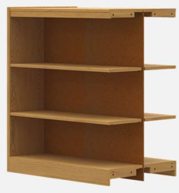
SHDA-4224 Double Face Adder 24" x 36"w x 42"h