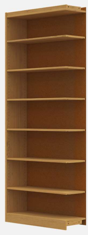
SHSA-9012 Single Face | Adder 12" x 36"w x 90"h