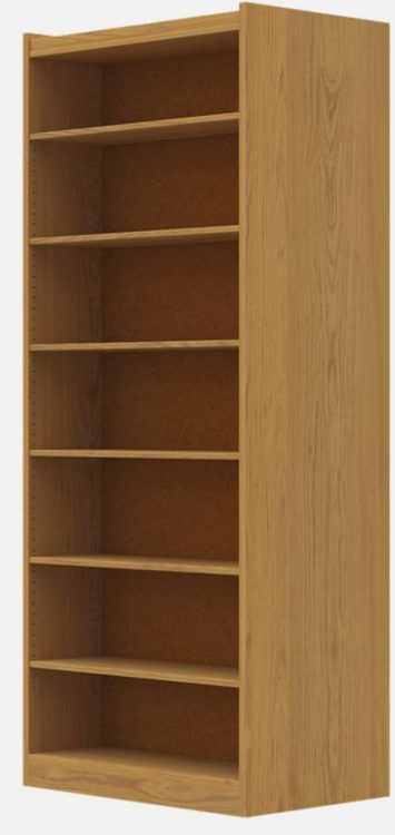
SHDS-9024 Double Face | Starter 24" x 37"w x 90"h