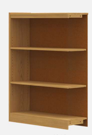
SHSA-4812 Single Face Adder 12" x 36"w x 48"h