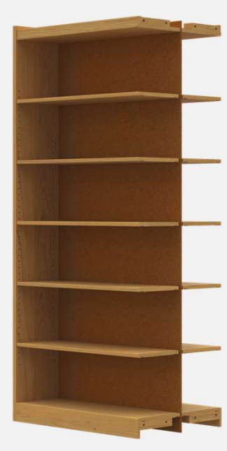
SHDA-8224 Double Face | Adder 24" x 36"w x 82"h