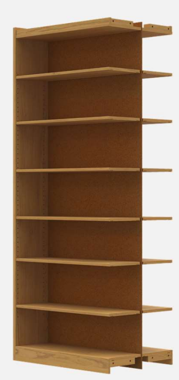
SHDA-9024 Double Face | Adder 24" x 36"w x 90"h

ModuForm recommends wall anchoring single face shelving to prevent tipping