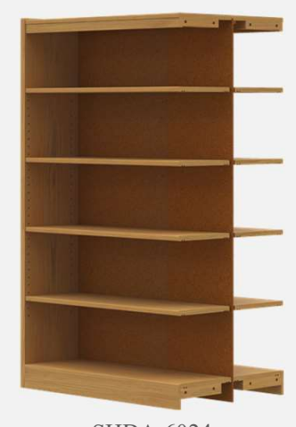
SHDA-6024 Double Face | Adder 24" x 36"w x 60"h