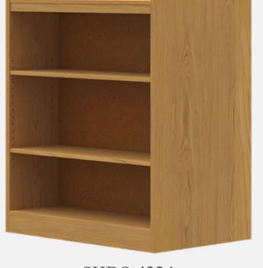
SHDS-4224 Double Face Starter 24" x 37"w x 42"h