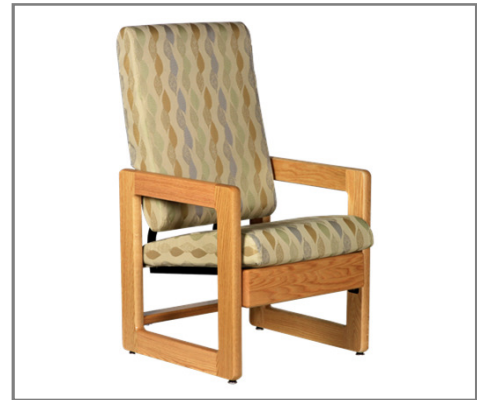
Fabric seat and back