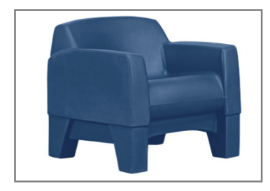
426 | Slate Blue