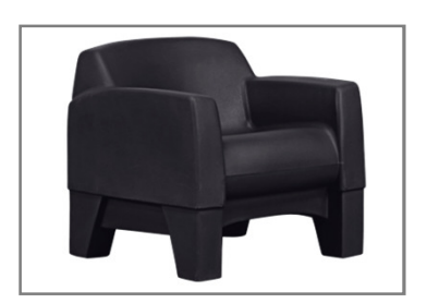
901 | Black