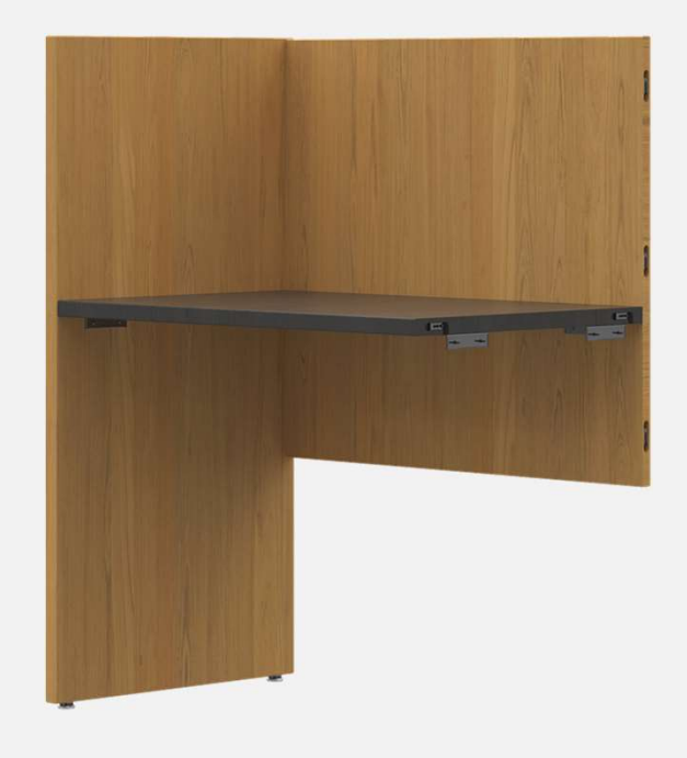
ACTCSA Adder 24"d x 37"w x 48.5"h