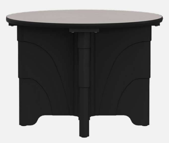
5005-42R-HPL 42" diameter x 30"

When personal space, durability, safety and cleanliness are needed, the ModuMaxx X-Base offers the essential features and construction to outlast erratic behaviors and the everyday requirements found in intensive use environments.