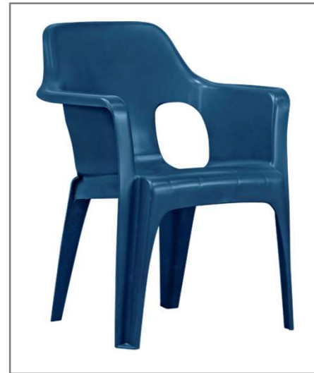
Slate Blue - 426