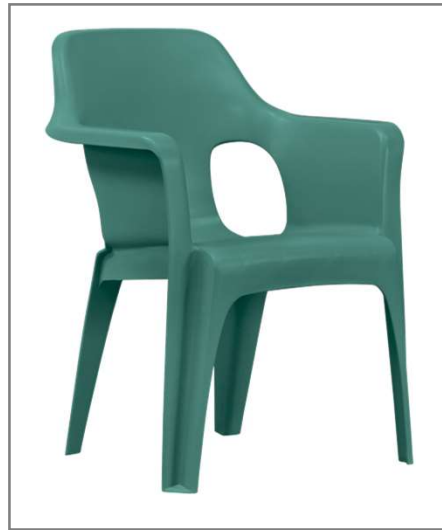
Splash - 225