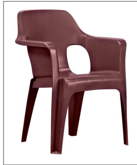
Burgundy - 318