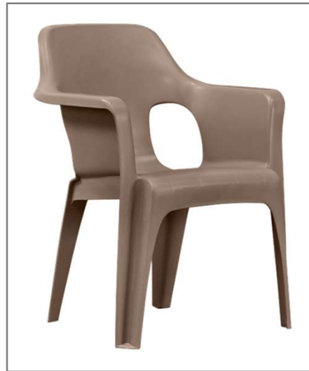
Sandstream - 700