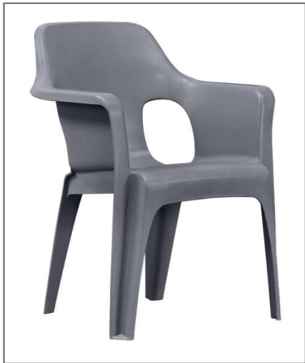
Flannel Grey - 845