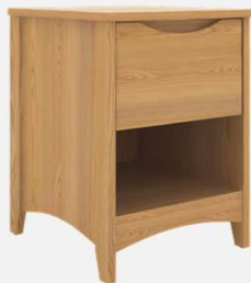
GL5A-1D Nightstand 18"d x 16.75"w x 22.5"h