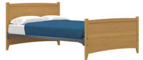
GL18-54: 54"d x 83.5"w x 36":26"h GL18-60: 60"d x 83.5"w x 36":26"h