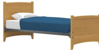
GL18: 36"d x 83.5"w x 36":26"h