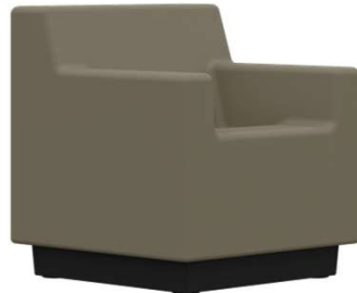
Fieldstone - 740