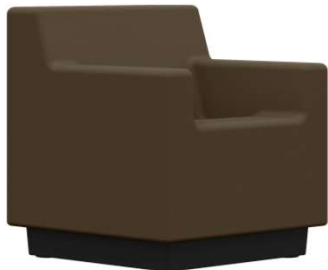
Cocoa - 704