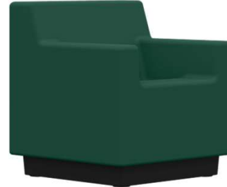
Emerald - 540