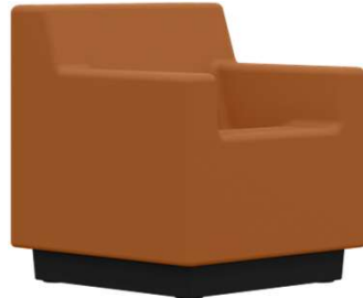
Terracotta - 702