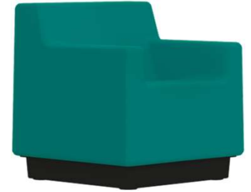
Splash - 225