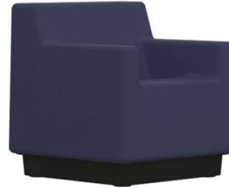
Huckleberry - 403