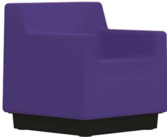
Plum - 215