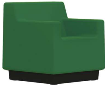
Leaf - 220