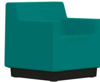
Splash - 225