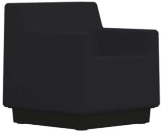
Black - 901