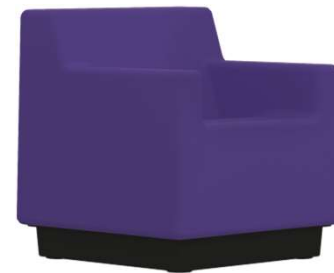
Plum - 215