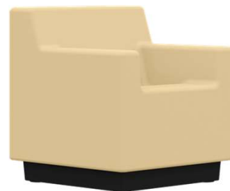
Drift - 728