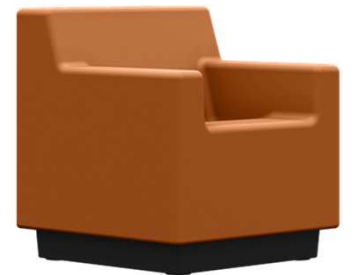
Earthy - 719