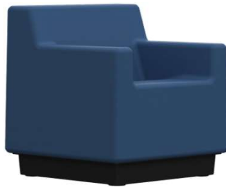
Slate Blue - 426