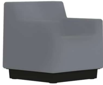
Flannel Grey - 845