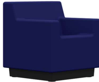
Cobalt - 404