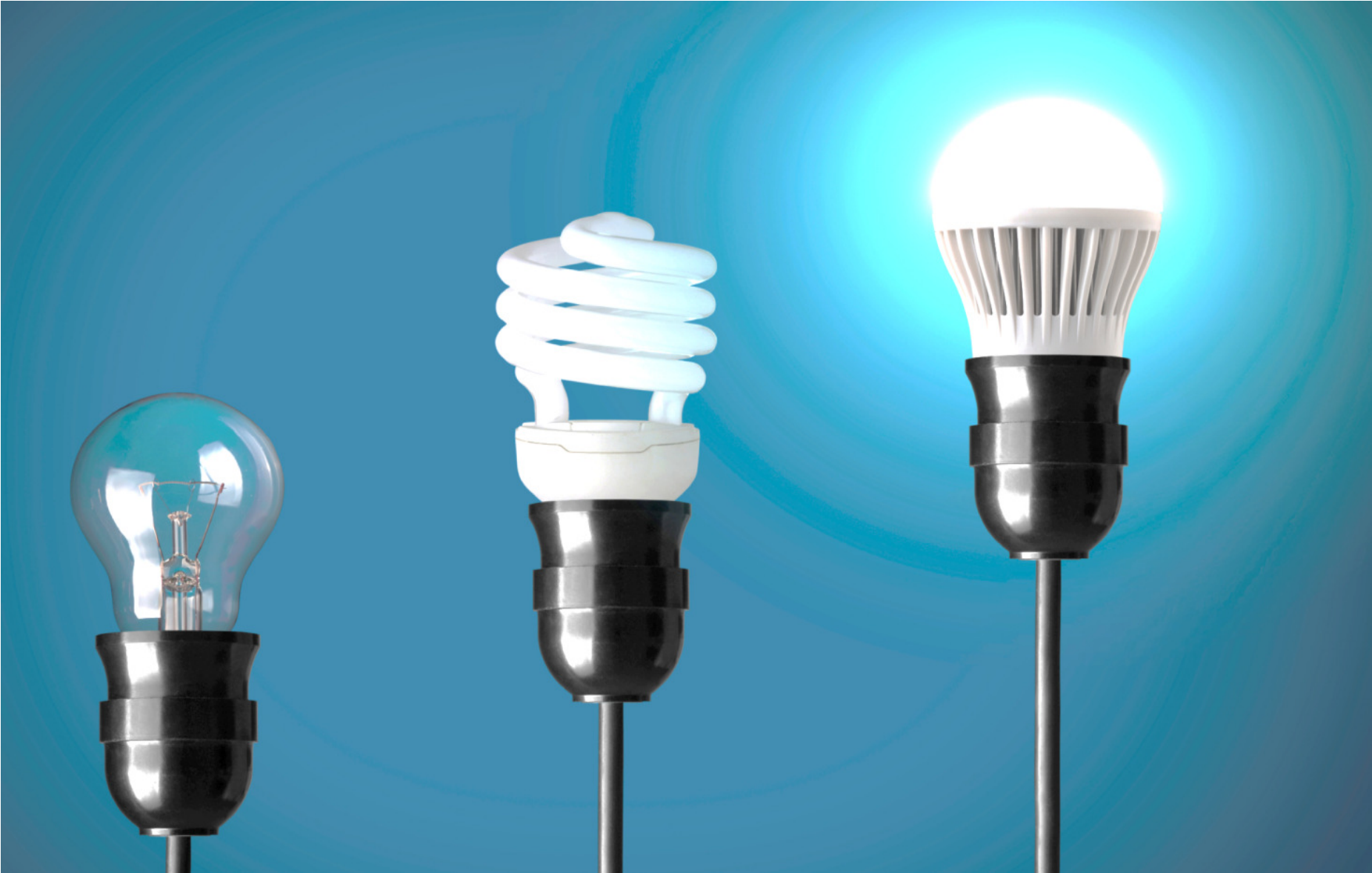
installation of high efficiency led lighting in 2016 | on/off motion detection in warehouse since 2000