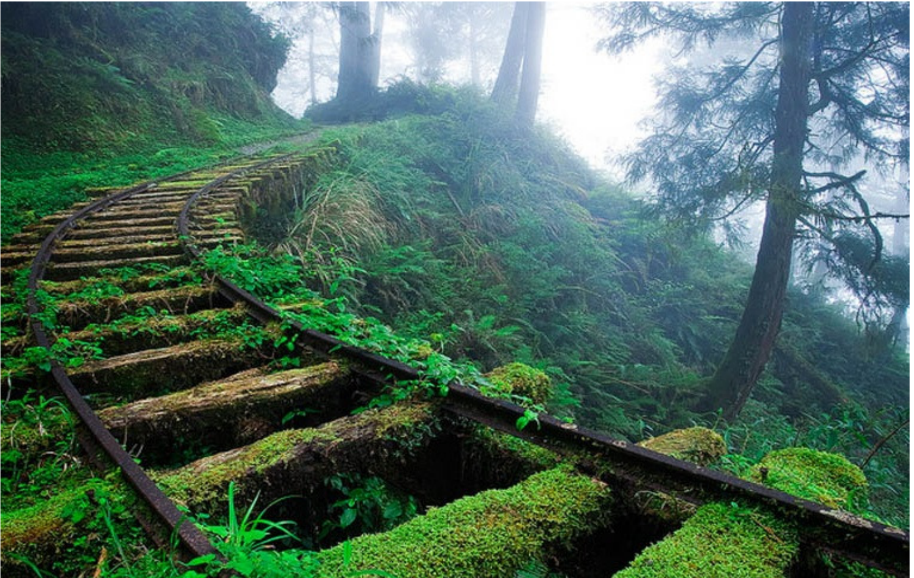
standard bed springs made from 100% recycled railroad tracks