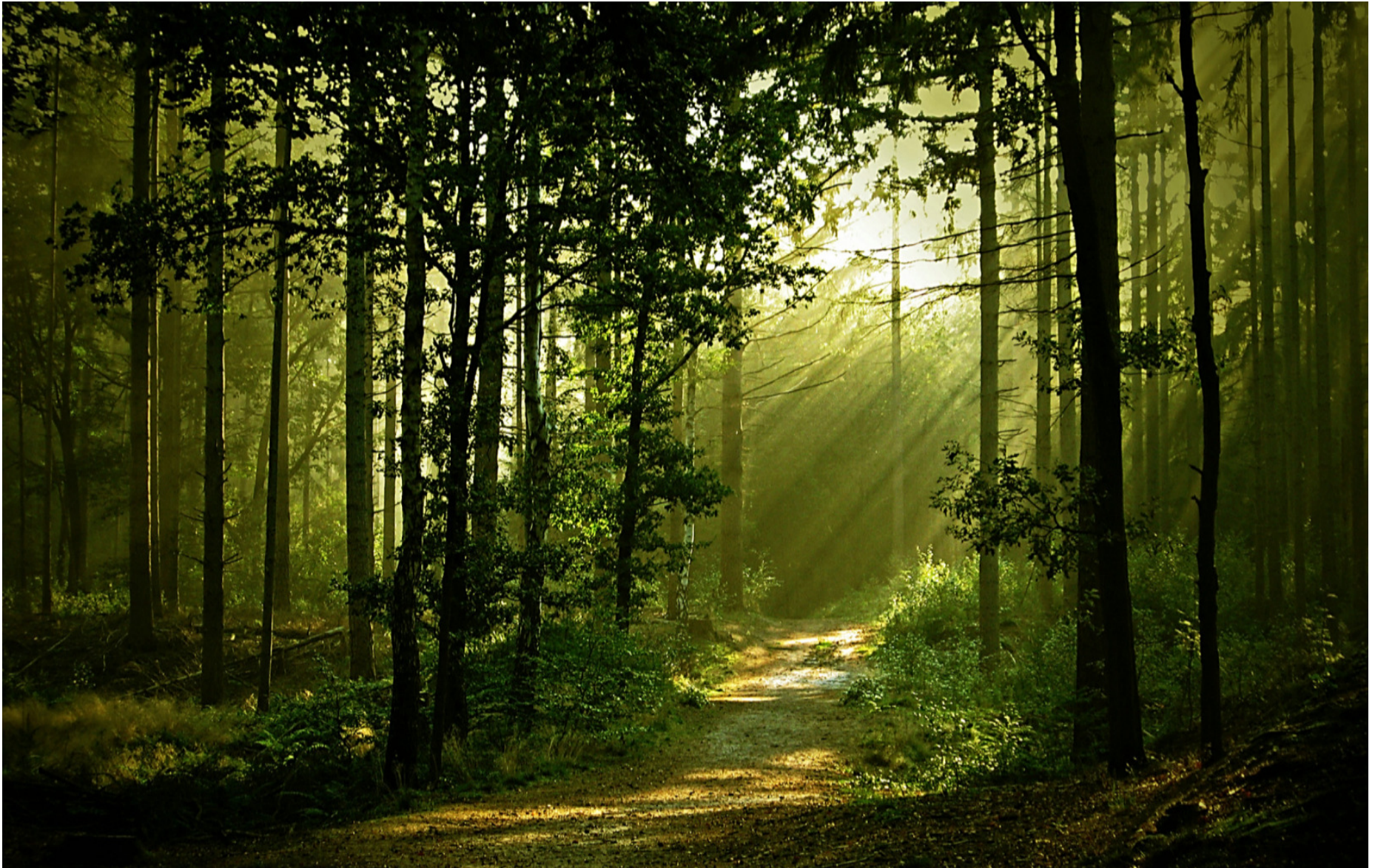
north american hardwoods | from privately owned and managed renewable forests