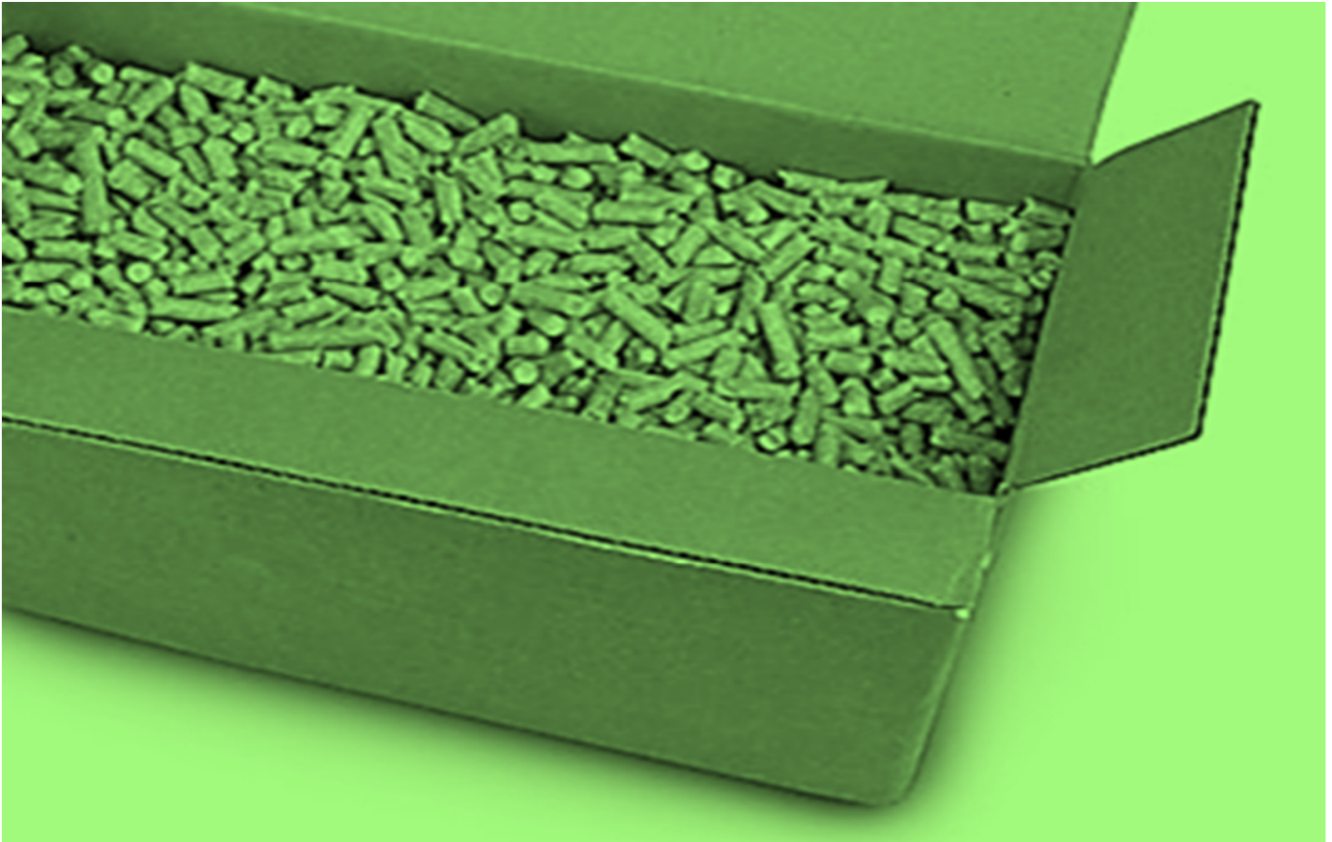
a portion of wood scrap and sawdust recycled into wood pellets