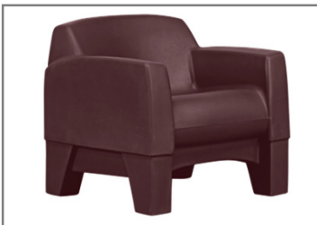
5000-250-318 | Burgundy 29.5"d x 29"w x 29"h 23.5" arm ht | 17.5" seat ht

Moduform rotationally molds a rigid, high-impact polyethylene that is sealed, seamless, puncture and fluid resistant. This provides a seating solution that is easy to keep clean as mild detergents, steam and bleach-based agents can be used to aid in the prevention of blood borne pathogens. The generous seat size allows for greater comfort, while the arms make it easy to sit or stand as they add support and safety to those who are seated. Units can be joined together to create banquette style lounge areas.