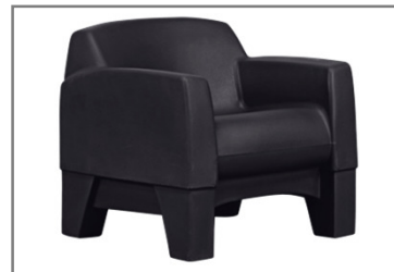
901 | Black