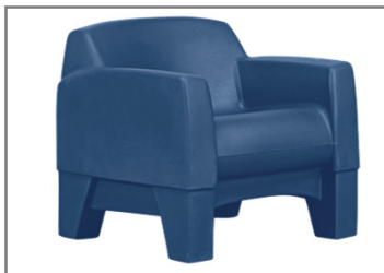
426 | Slate Blue