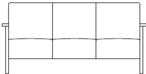
SF8103 Marco Three-Seat Sofa 32.25"d x 69"w x 35.5"h 24.5" arm ht 18.5" seat ht

Coordinating wood tables and chairs available