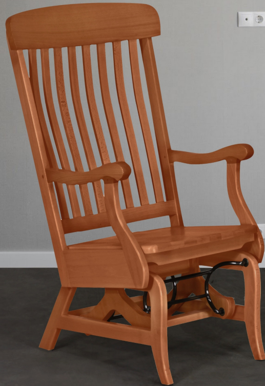
Olive's Chair in Light Cherry | ROC01-LC

Olive's frame is constructed with solid beech components enhanced with mortise and tenon joinery, glued and screwed for durability. Patented sealed ball bearing mechanism produces a true rocking motion; not gliding. Solid seat with machined scoop for additional comfort. Optional seat and back cushions can be easily affixed. Available with side panels, locking mechanism and complimenting ottoman as shown below.