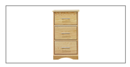
HL5B-3D | Nightstand 18.5"d x 17"w x 31.25"h

The Hollis collection of casegoods has been designed and engineered to withstand daily use in active environments. Hollis features oak or veneer sides, solid oak or maple drawer fronts and tops; all assembled in high pressure automated clamps to ensure every cabinet is square and of the highest quality. Cabinets tops feature radiused edges and corners while being finished, inside and out, with our specially formulated UV cured resin; the most durable, easiest to clean, environmentally friendly and longest lasting finishing material available.