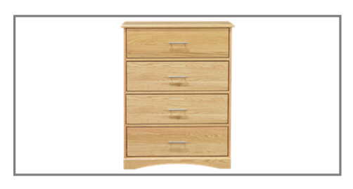
HL4B | Dresser 18.5"d x 31.25"w x 37.5"h