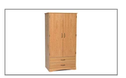
HL6C2 | Wardrobe 24.5"d x 37.25"w x 74"h