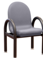
Flannel Grey 845