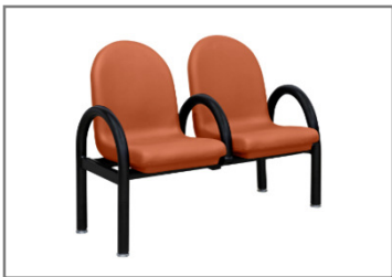
3000-2001 22"d x 43.5"w x 31.5"h

Short-term seating solutions designed and engineered to withstand the challenges of high-traffic spaces. Moduform's specially formulated, rotationally molded vinyl is 200 mils thick, seamless, sealed and puncture resistant. Seats are easy to clean with mild detergents, steam or bleach-based agents. The leather textured exterior skin is comfortable, pick resistant, attached to the beam with metal to metal fasteners and will look great for years. The steel tubular beam can be bolted to the floor or left free standing on its heavy-duty adjustable glides.