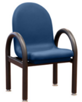
Slate Blue 426