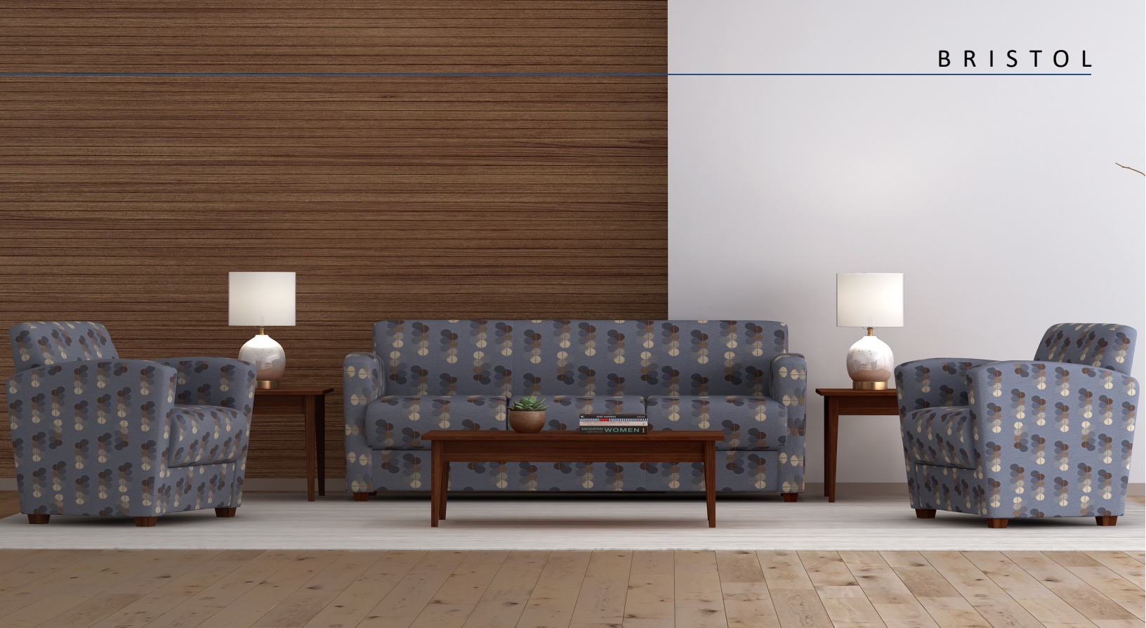
SF5101 BRISTOL CHAIR | SF5103 BRISTOL SOFA | 1160-701L LAMP TABLE | 1160-04 COFFEE TABLE

Bristol's frame components are machined into puzzle like pieces on state of the art CNC equipment to within the tightest of tolerances. During the assembly process, these components lock together while commercial adhesives and mechanical fasteners are introduced to further enhance the construction. This process results in the most durable, robust and stable foundation from which to build upholstered furniture. Sinuous wire springs are added, tied together and connected to tape lined clips which prevent squeaking. This improves the longevity and overall strength. Foam is commercial grade for comfort and resiliency. Fabric is upholstered to the frame with precision for a tailored fit and finish.