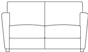
SF5102 Bristol Two-Seat Sofa 30.5"d x 56.5"w x 32.5"h 25.5" arm ht 17.5" seat ht