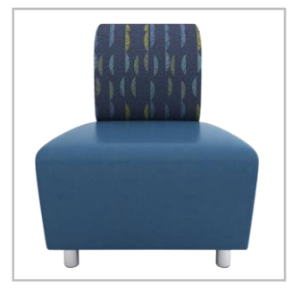
SF6222IA Chelsea 22° Inside Angle Chair