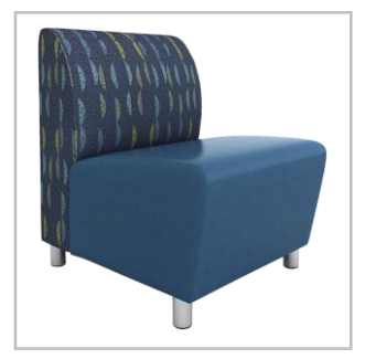
SF6201 Chelsea Chair

Flexible, modular and configurable pieces create environments that promote collaboration and social interaction or can be separated to allow for more quiet and uninterrupted time. Chelsea seating groups and tables are perfect for active learning environments or spaces where reconfiguration is common. Available in an infinite array of fabrics and other options, Chelsea's frame components are machined into puzzle like pieces on state-of-the-art CNC equipment to within the tightest of tolerances. During the assembly process, these components lock together while commercial adhesives and mechanical fasteners are introduced to further enhance the construction. This process results in the most durable, robust and stable foundation from which to build upholstered furniture. Sinuous wire springs are added, tied together and connected to tape lined clips which prevent squeaking. This improves the longevity and overall strength. Foam is commercial grade for comfort and resiliency. Fabric is upholstered to the frame with precision for a tailored fit and finish.