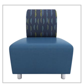
SF6222OA Chelsea 22° Outside Angle Chair