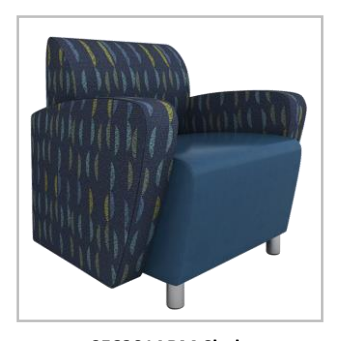
SF6201ARM Chelsea Armchair