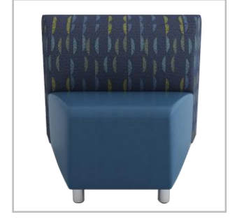
SF6245 Chelsea 45° Inside Angle Chair