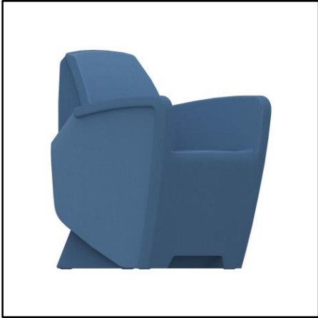
Slate Blue 426