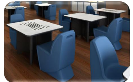
50-701 Armless Chair

50-702 is a seamless and sealed polyethylene armchair that is resistant to kicking, scratching, fluids, moisture and ligature. There are no frames, no springs and no sharp edges. This offers greater comfort, safety, security and the ability to clean with steam, mild detergents or bleach-based cleaners that aid in the control of blood borne pathogens. The chair can be weighted with additional ballasting material if necessary.