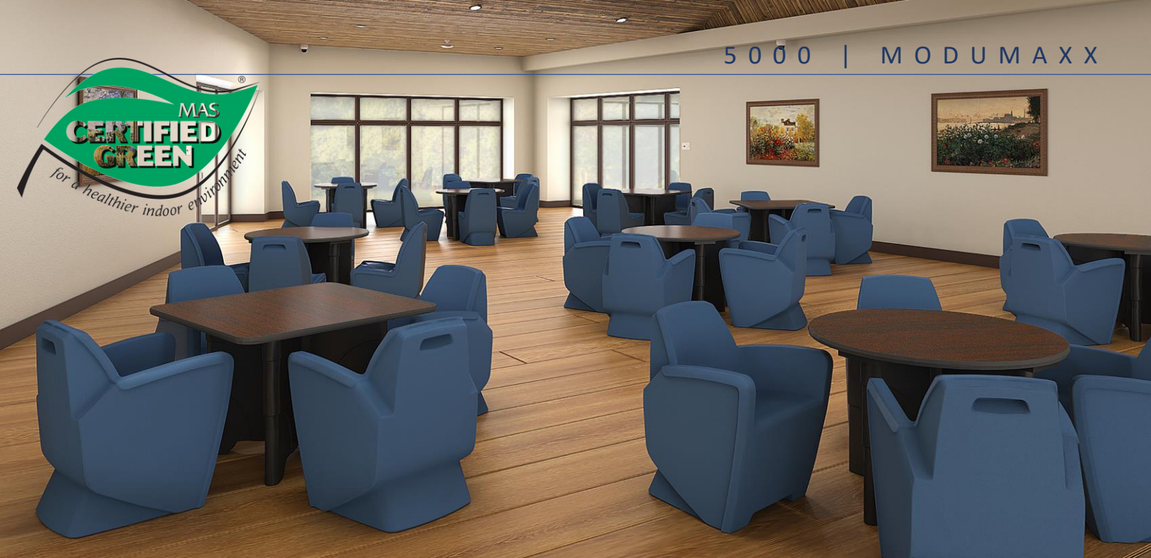
50-702 ModuMaxx Armchair | 5000-542S & 5000-542R ModuMaxx X-Base Tables