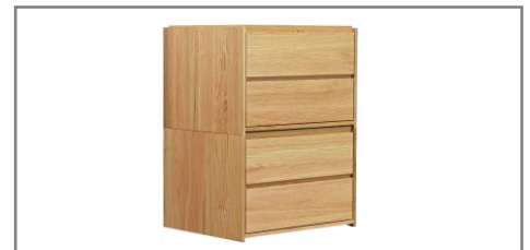
EV4SC | 2 Drawer Stacking Chest