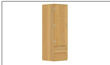
EV6C2-1D | Wardrobe