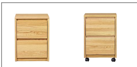
EV5A-2D | Nightstand EV5MP-2D | Mobile Pedestal