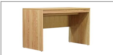
EV3ANP | Writing Desk

The Everest collection of bedroom furniture has been designed and engineered to withstand daily use in active environments. Everest features oak veneer with hardwood plycore sides, solid planked oak drawer fronts, high pressure laminate tops with matching edges and is assembled in self-setting electromagnetic clamps to ensure every cabinet is square and of the highest quality. Cabinets, inside and out, are sealed with our specially formulated 100% resin top-coat, hardened and cured under UV lamps; the most durable, easiest to clean and environmentally friendly finishing process available.