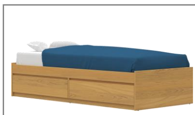
EV9-2D | Platform Bed