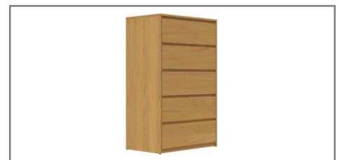
EV4C | 5 Drawer Dresser