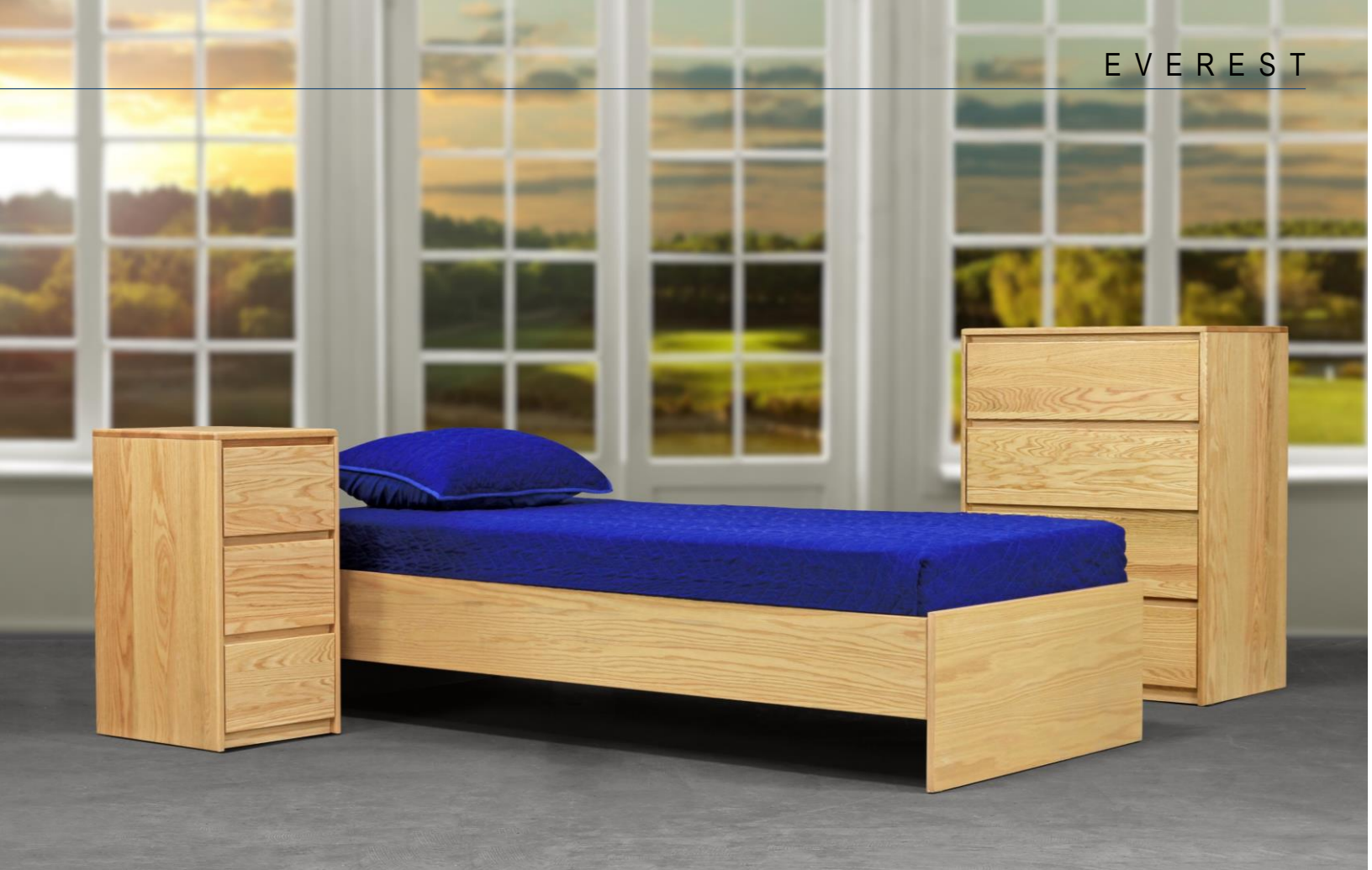
EV5B-3D Nightstand | EV9-ES Elevated Side Platform Bed | EV4B-18 Dresser

The Everest collection of bedroom furniture has been designed and engineered to withstand daily use in active environments. Everest features oak veneer with hardwood plycore sides, solid planked oak drawer fronts, high pressure laminate tops with matching edges and is assembled in self-setting electromagnetic clamps to ensure every cabinet is square and of the highest quality. Cabinets, inside and out, are sealed with our specially formulated 100% resin top-coat, hardened and cured under UV lamps; the most durable, easiest to clean and environmentally friendly finishing process available.