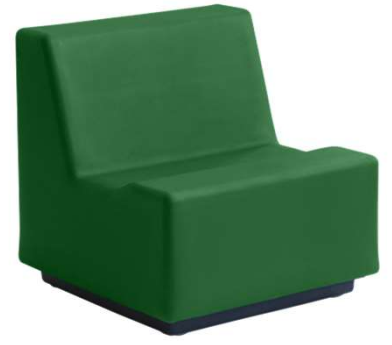
220 | Leaf