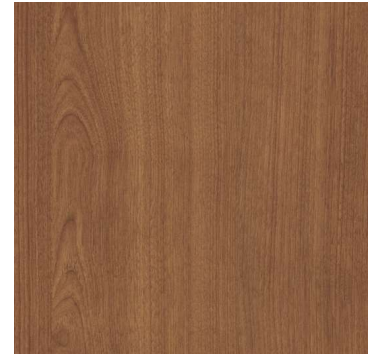
LIGHT CHERRY | LC Formica 5904-58 Wild Cherry Maple