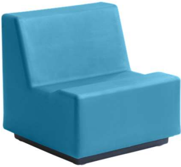
210 | Sky

NOTE – Colors listed below are for ModuForm’s molded and flexible vinyl products found in: 350 Series Rockers Grade 7 & 9 Cushions, 450 Series Seclusion Beds, 520 ModuForm lounge, 800 Series ModuBlock Grade 7 & 9 Cushions, 810 Series ModuEsque Grade 7 & 9 Cushions and 3000 Beam Seating. Please contact Customer Service at 800-221-6638 for more information.