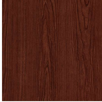
CHERRY | CO Formica 7759-58 Select Cherry Oak & Maple