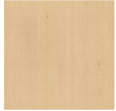
NATURAL MAPLE | NM Formica 86992-58 Hard Rock Maple