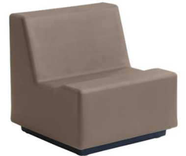
700 | Sandstream*