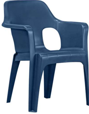
5000-20-426* Slate Blue