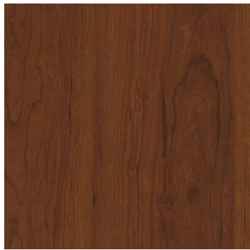
LIGHT CHERRY | LC Formica 6208-58 Glamour Cherry Oak