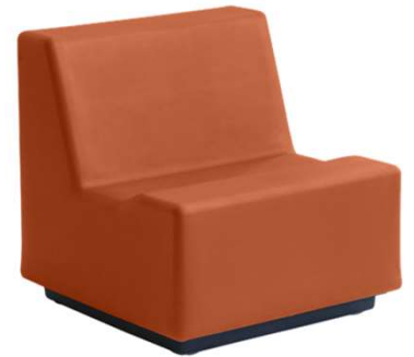
230 | Canyon