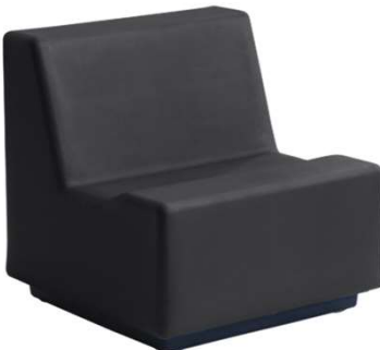
901 | Black