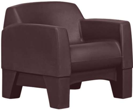
318 | Burgundy*