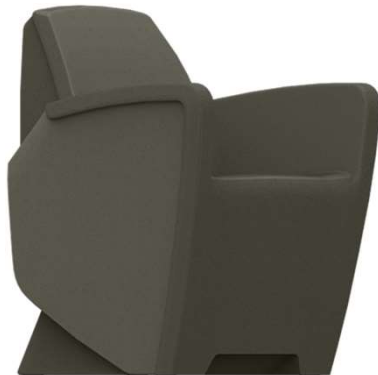
902 | Shade