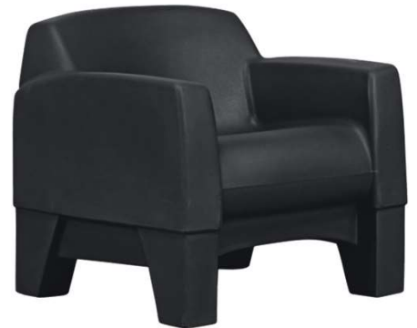
901 | Black*