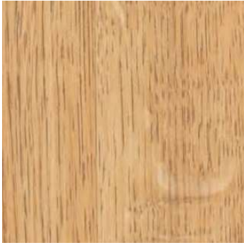
LIGHT OAK | LO Formica 7152-58 Northern Oak