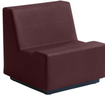
318 | Burgundy*