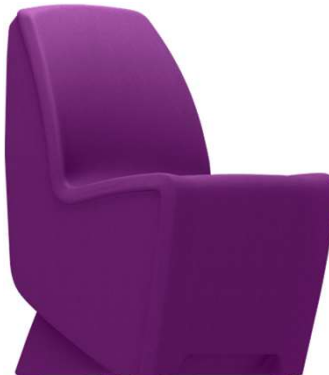
360 | Grape