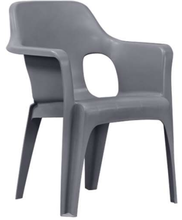
5000-20-845 Flannel Grey