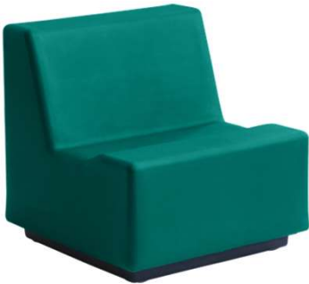
225 | Splash