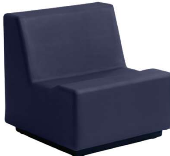
403 | Huckleberry