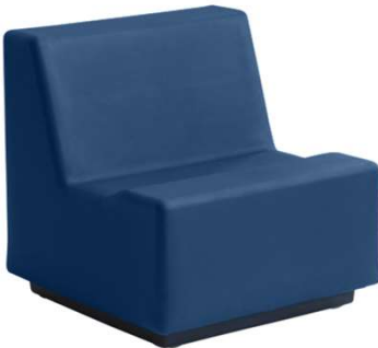
426 | Slate Blue*