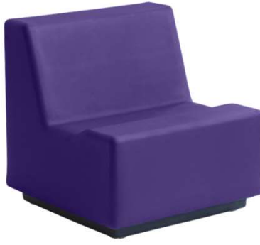
215 | Plum