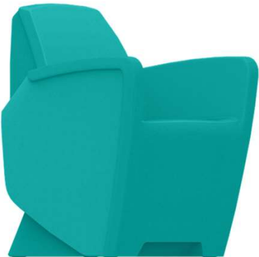
445 | Surf