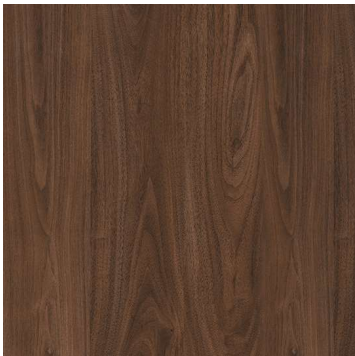
WALNUT | WL Formica 6402-42 Thermo Walnut Oak & Maple