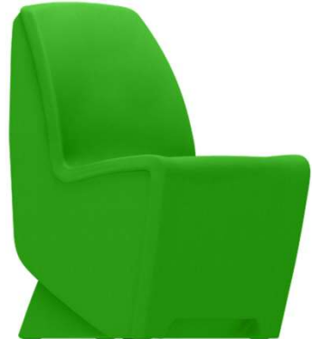
525 | Celtic

*NOTE – Colors 318 Burgundy, 426 Slate Blue and 700 Sandstream will vary slightly between collections as the materials used in the manufacturing process are different. For example, 318 burgundy will vary between 5000-250, 520 models and 5000-20. Please contact Customer Service at 800-221-6638 for more information.