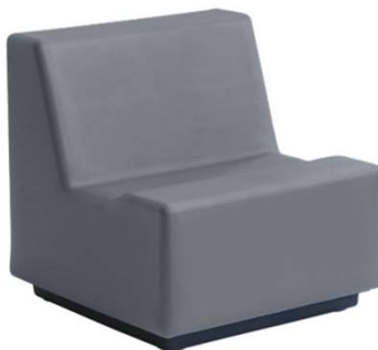
845 | Flannel Gray*