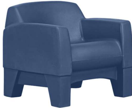
426 | Slate Blue*