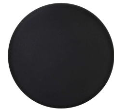
Black | BK

Bases – for 450 Seclusion Beds and 520 Lounge Seating