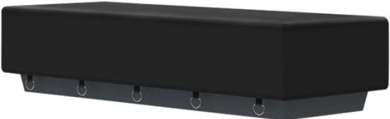
Black - 901