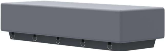
Flannel Grey - 845