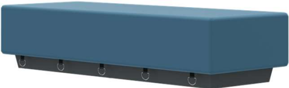
Slate Blue - 426