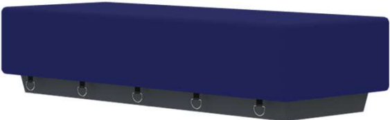
Cobalt - 404