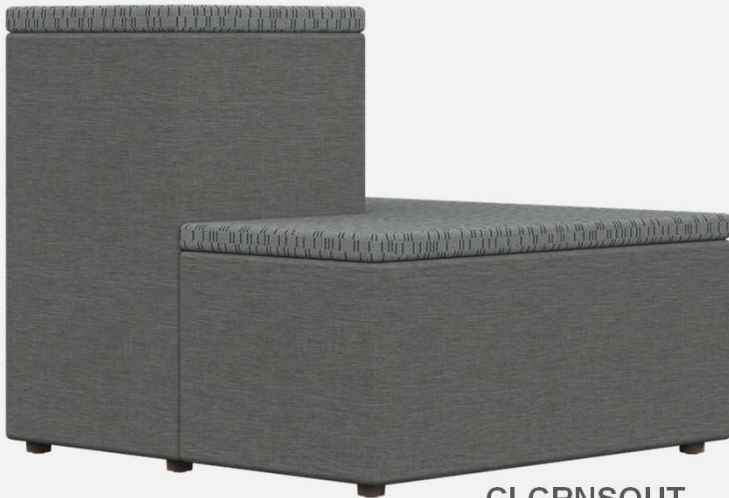
CLCRNSOUT 40”w x 40”d x 34.5”h