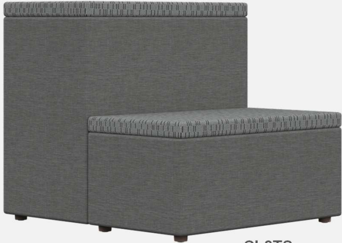
CL3TS 36”w x 40”d x 34.5”h