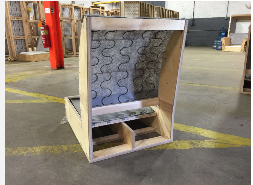
Frames assembled with interlocking components and reinforced utilizing high-grade commercial quality adhesive and galvanized coated framing fasteners