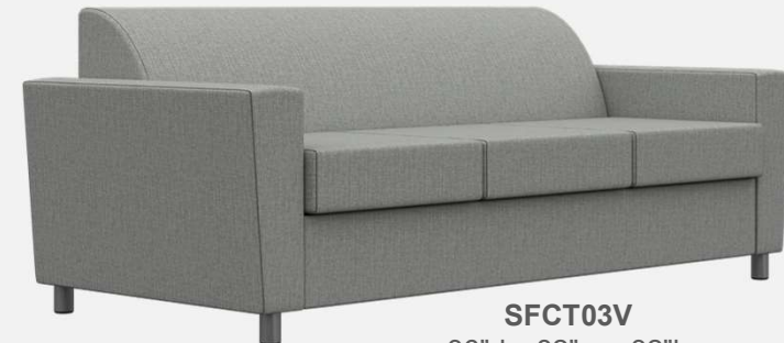
SFCT03V 36"d x 82"w x 32"h 17.5" Seat Height 24" Arm Height