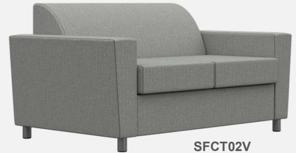
SFCT02V 36"d x 59"w x 32"h 17.5" Seat Height 24" Arm Height