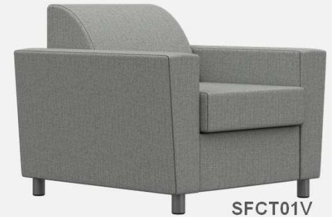
SFCT01V 36"d x 36"w x 32"h 17.5" Seat Height 24" Arm Height