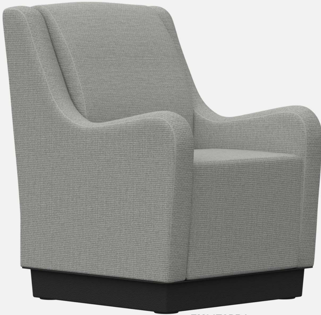
EM01TSPB4 34"d x 30"w x 38"h 125 Pounds