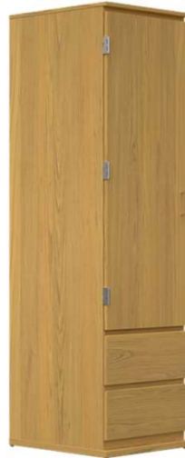
EV6C2S-1D 24"d x 20"w x 75.5"h