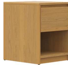
1 Drawer Nightstand EV5A-1D 18"d x 15.25"w x 20.5"h