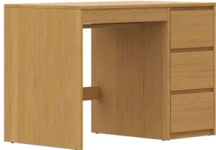
3 Drawer Pedestal Desk EV3A 24"d x 42"w x 30"h EV3B 24"d x 48"w x 30"h