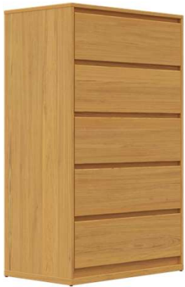
5 Drawer Dresser EV4CS-18