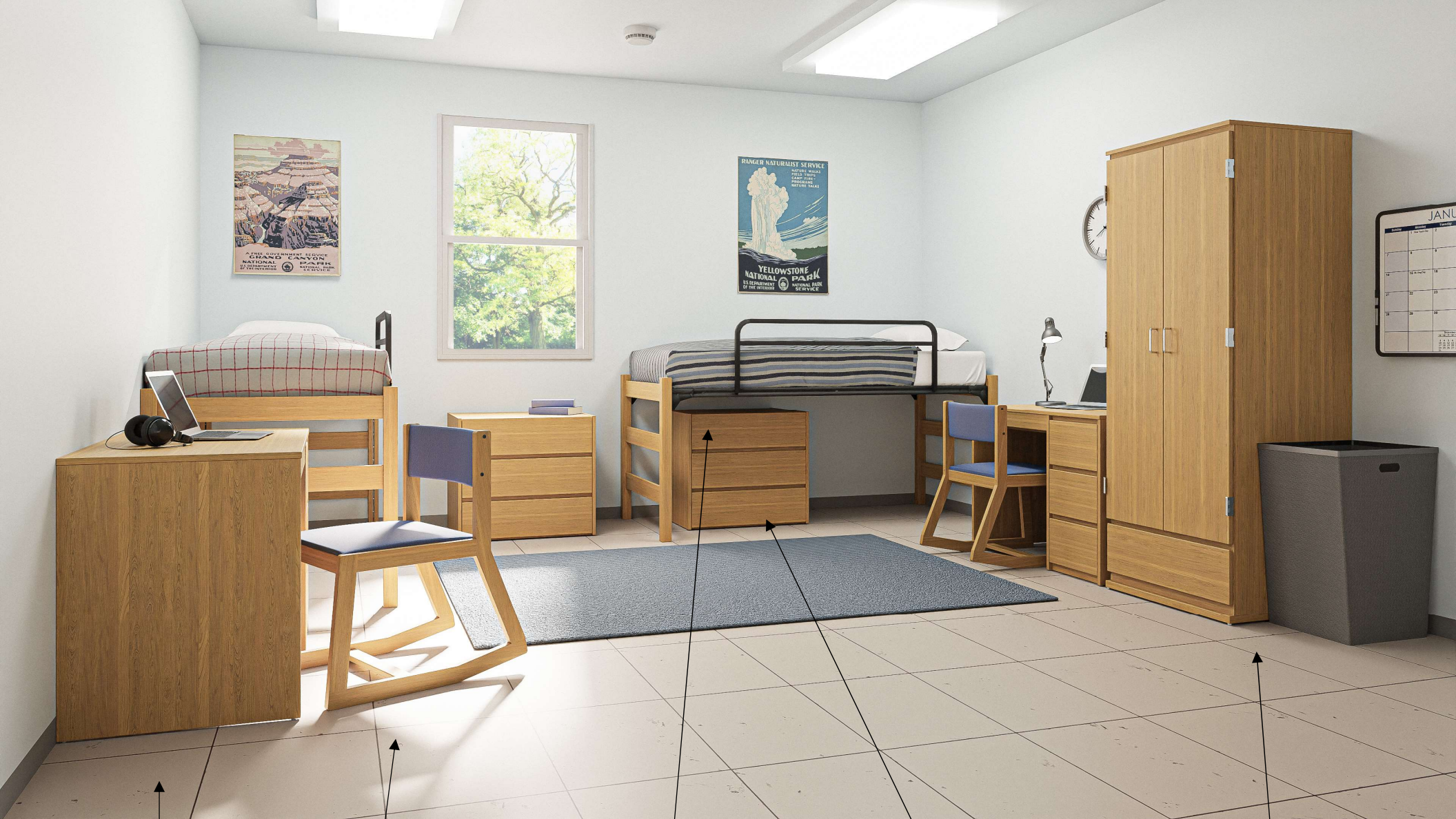
EV3A | Pedestal Desk 24"d x 42"w x 30"h