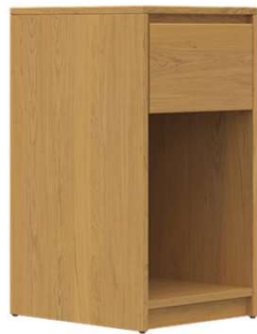
1 Drawer Nightstand EV5B-1D 18"d x 15.25"w x 30"h