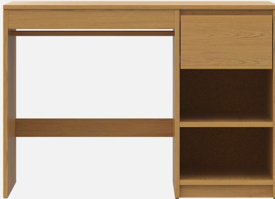
Single Drawer with 2 Opening Pedestal Desk EV3A-1D2O 24"d x 42"w x 30"h