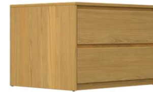
2 Drawer Dresser EV4Y-24