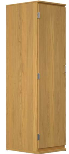
EV6BS-1D 24"d x 20"w x 75.5"h