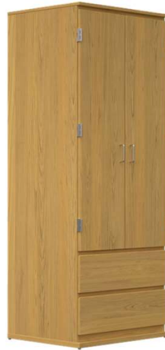
EV6C2S 24"d x 29.25"w x 75.5"h