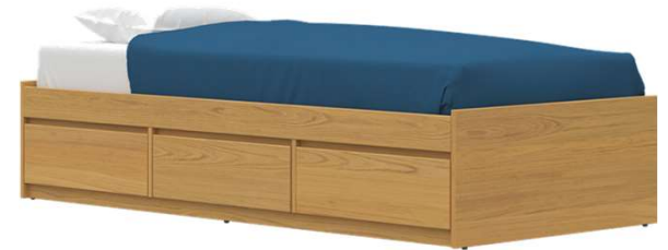
EV9-3D 3 Equal Drawers 37.5"d x 81.5"w x 16.25"h