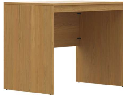
Writing Desk EV3YNP 24"d x 36"w x 30"h