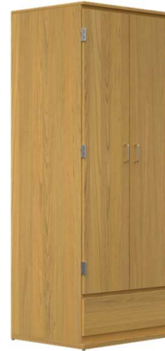
EV6C1S 24"d x 29.25"w x 75.5"h