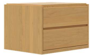
2 Drawer Stacking Dresser EV4SC-2D