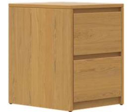
2 Drawer Nightstand EV5A-2D 18"d x 15.25"w x 20.5"h