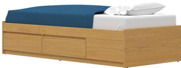
GL9-2DR Drawers on Right 37.5"d x 81.5"w x 16.25"h