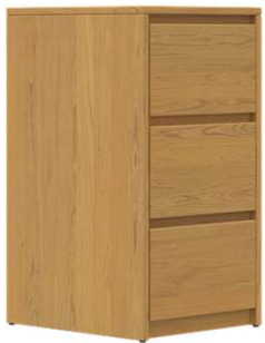
3 Drawer Nightstand EV5B-3D 18"d x 15.25"w x 30"h