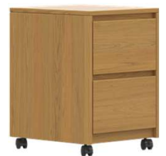
2 Drawer Mobile Pedestal EV3MP 18"d x 15.75"w x 21.5"h