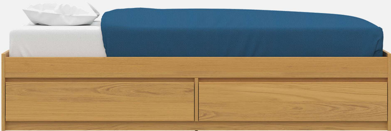
EV9-2D 2 Equal Drawers 37.5"d x 81.5"w x 16.25"h