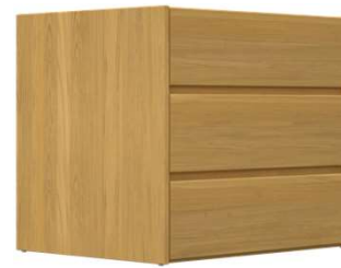
3 Drawer Dresser EV4A26-24