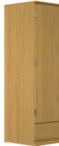
EV6C1S-1D 24"d x 20"w x 75.5"h