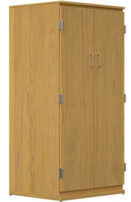
EV6AS 24"d x 29.25"w x 60.5"h