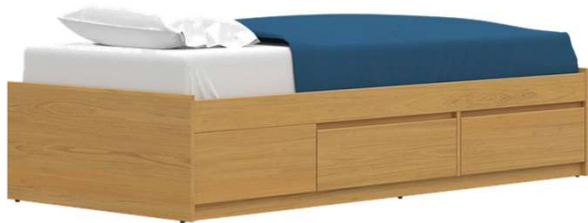
GL9-2DL Drawers on Left 37.5"d x 81.5"w x 16.25"h