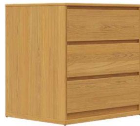
3 Drawer Dresser EV4AS-24