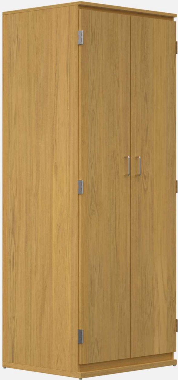
EV6BS 24"d x 29.25"w x 75.5"h