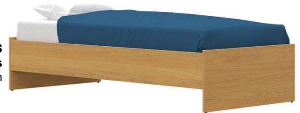
EV9C-ES Elevated Sides 37.5"d x 81.5"w x 16.25"h