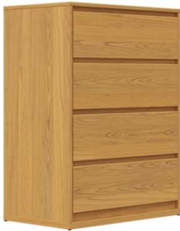
4 Drawer Dresser EV4BS-18