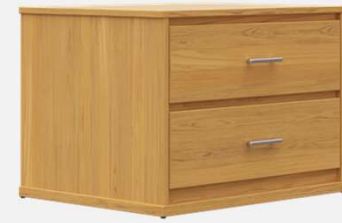
FIT4Y-24 2 Drawer Dresser 24"d x 30.5"w x 20.5"h