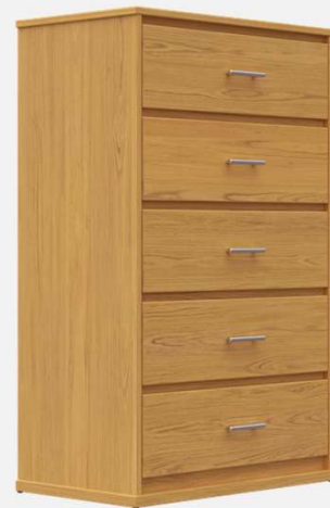
5 Drawer Chest