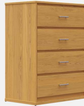
FIT4BS-18 18"d x 30.5"w x 39.5"h