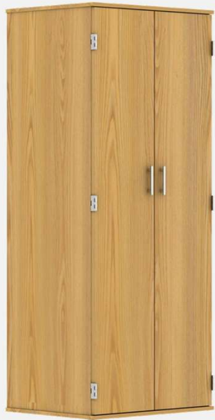
FIT6BS Wardrobe 24"d x 30.5"w x 75"h