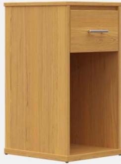
GL5B-1D Nightstand 18"d x 16.75"w x 30"h