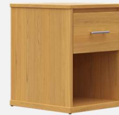
GL5A-1D Nightstand 18"d x 16.75"w x 20.5"h