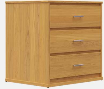
3 Drawer Dresser