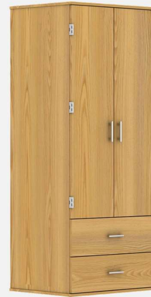
FIT6C2S Wardrobe 24"d x 30.5"w x 75"h