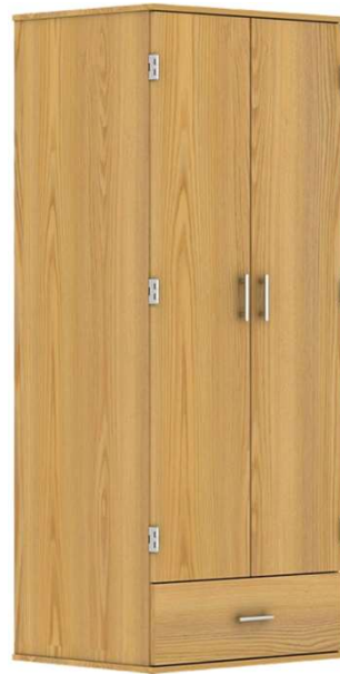
FIT6C1S Wardrobe 24"d x 30.5"w x 75"h