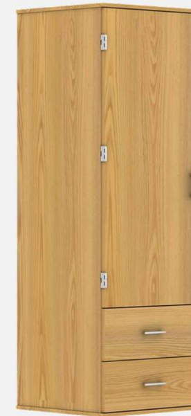
FIT6C1S20-2D Wardrobe 24"d x 20.5"w x 75"h