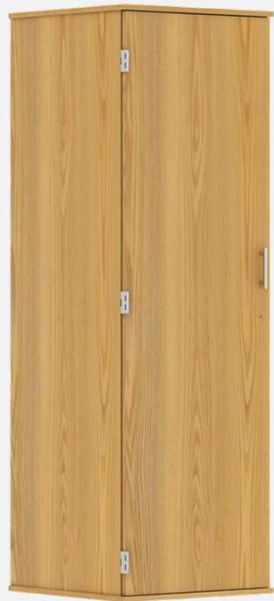
FIT6BS20-1D Wardrobe 24"d x 20.5"w x 75"h