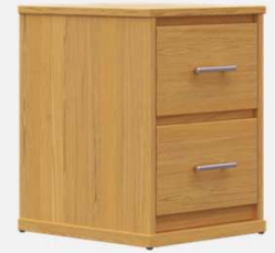
GL5A-2D Nightstand 18"d x 16.75"w x 20.5"h