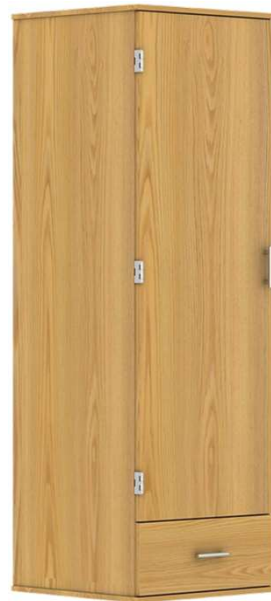
FIT6C1S20-1D Wardrobe 24"d x 20.5"w x 75"h