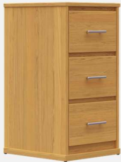
GL5B-3D Nightstand 18"d x 16.75"w x 30"h