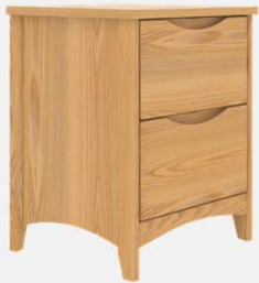
GL5A-2D Nightstand 18"d x 16.75"w x 22.5"h