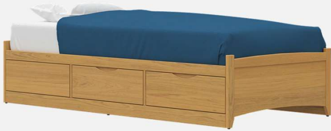
GL9-2DL Drawers on Left 37"d x 82"w x 17.5"h