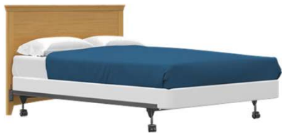
GLB54: 40.25"d x 78"w x 36"h GLB60: 62.25"d x 83"w x 36"h