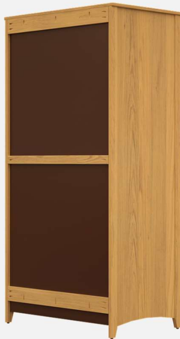
GL6C2WU20-1D Wardrobe Built-In 24"d x 20.74"w x 75"h