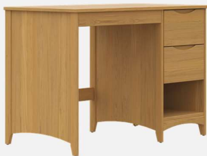
GL3A-2D Pedestal Desk 24"d x 42.75"w x 30"h