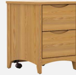
GL3MP-2D Mobile Pedestal 18"d x 16.75"w x 22.5"h