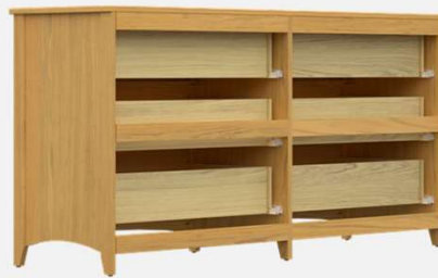
GL4DWU 6 Drawer Chest Built-In 18"d x 60"w x 30.5"h