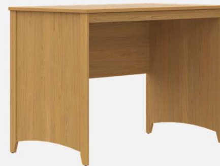
GL3YNP Writing Desk 24"d x 36.75"w x 30"h