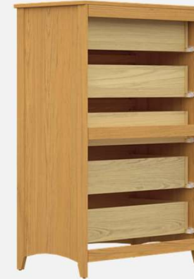
GL4CWU 5 Drawer Chest Built-In 18"d x 30.75"w x 46.5"h