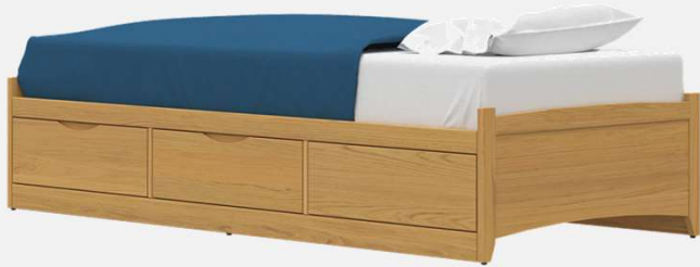
GL9-2DR Drawers on Right 37"d x 82"w x 17.5"h