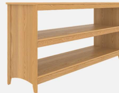
GL10TV60 Media Stand 18"d x 60"w x 30.5"h