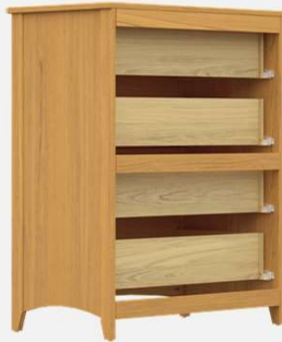
GL4BWU 4 Drawer Chest Built-In 18"d x 30.75"w x 38.5"h