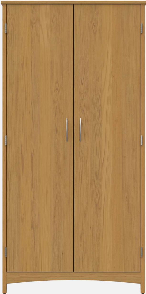
GL6BWU-2D Wardrobe Built-In 24"d x 37"w x 75"h