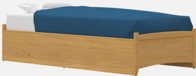
GL9ND Full Length Sides 37"d x 82"w x 17.5"h