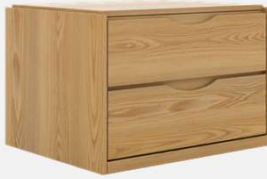
GL4SC-2D Stacking Chest 24"d x 30.75"w x 20.5"h