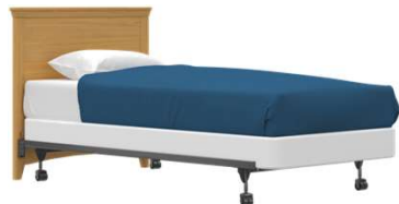
GLB39: 56.25"d x 78"w x 36"h