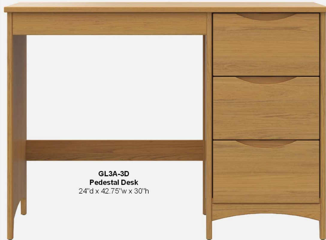
GL3A-3D Pedestal Desk 24"d x 42.75"w x 30"h