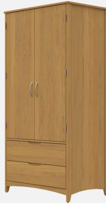
GL6C2WU Wardrobe Built-In 24"d x 37"w x 75"h