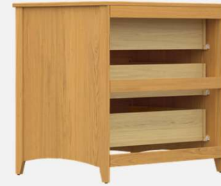
GL4AWU 3 Drawer Dresser Built-In 24"d x 30.75"w x 30.5"h