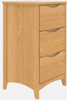
GL5B-3D Nightstand 18"d x 16.75"w x 30.5"h