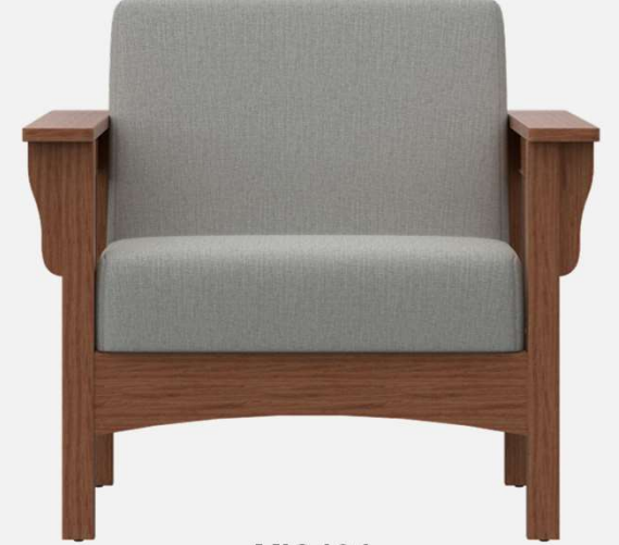
MIS101 CHAIR 33.5"d x 31.25"w x 29.5"h 15.5" Seat Height 22.5" Arm Height