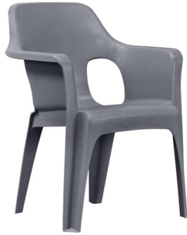
Flannel Grey - 845