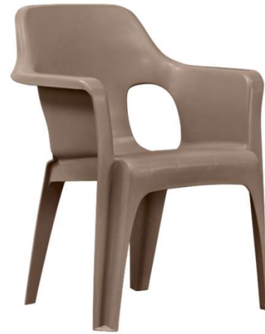
Sandstream - 700