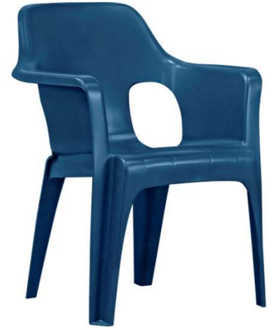
Slate Blue - 426