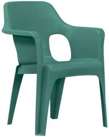
Splash - 225