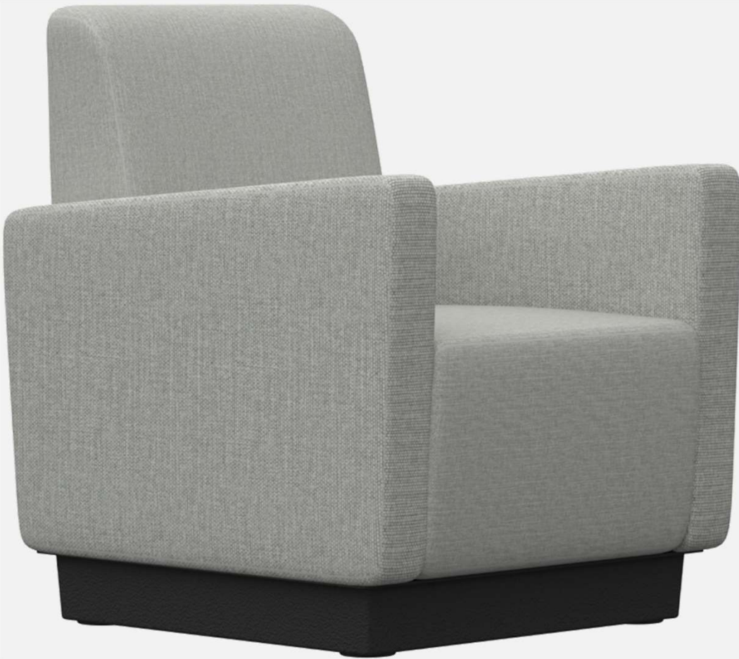
SUN01TSPB4 32.5"d x 30"w x 34.5"h 115 Pounds