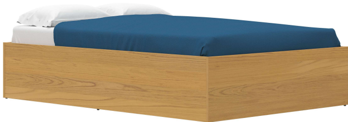
TR9C-54 Double Bed 54"d x 81.5"w x 16.25"h 14" Deck Height