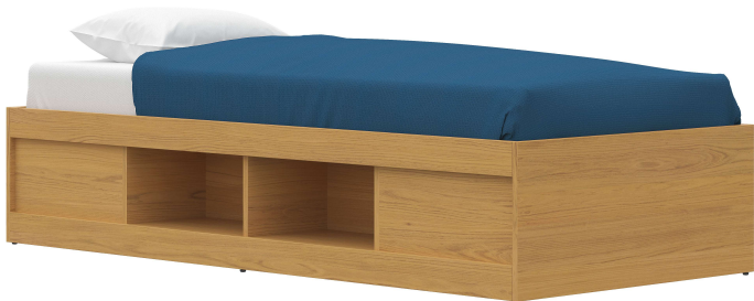
TR9C-CUB Cubby Storage 37.5"d x 81.5"w x 16.25"h 14" Deck Height