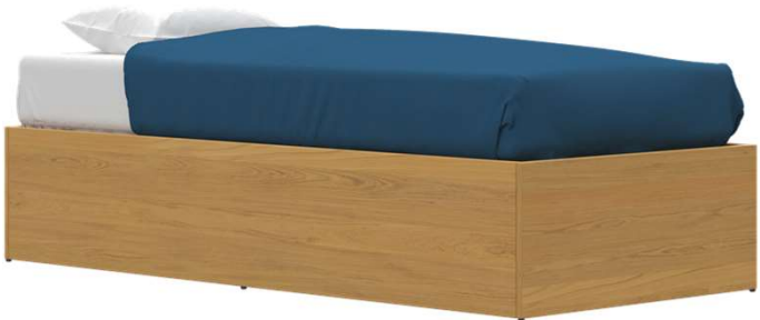
TR9C Conventional 37.5"d x 81.5"w x 16.25"h 14" Deck Height