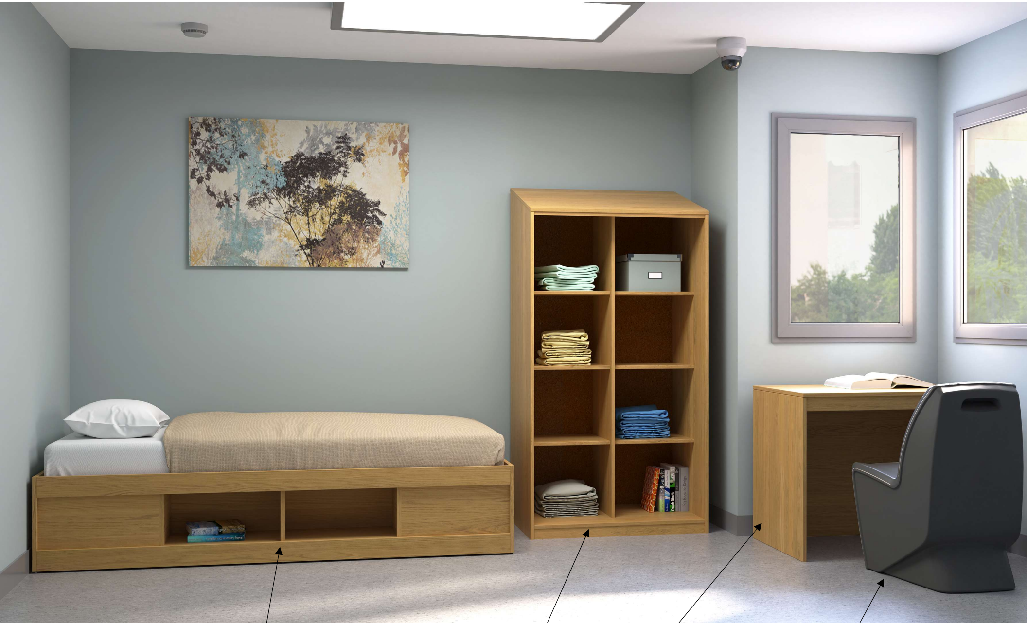
TR9C-CUB Platform Bed