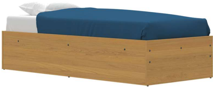
TR9SF Steel Frame 37.5"d x 81.5"w x 16.25"h 14" Deck Height