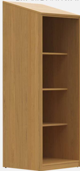
FR6ST1-40-24 23.5"d x 24"w x 70.5"h