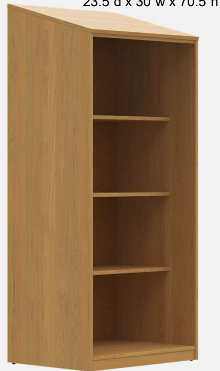
FR6ST1-40-30 23.5"d x 30"w x 70.5"h