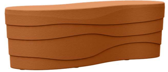
Earthy - 728