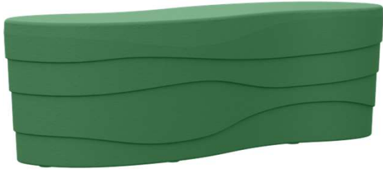
Leaf - 220