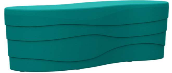
Surf - 445