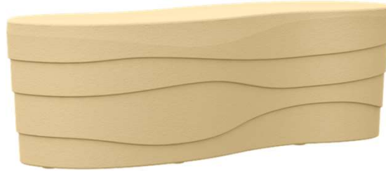
Drift - 718