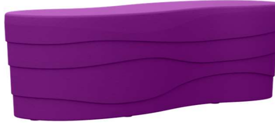
Grape - 360