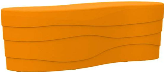
Citrus - 201