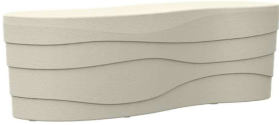
Soothe - 705