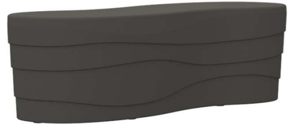
Shade - 902