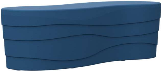
Slate Blue - 426