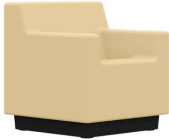
Drift - 728