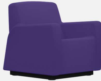
Plum - 215