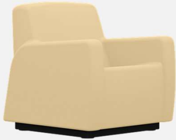
Drift - 728