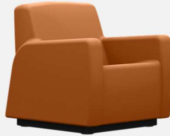
Earthy - 719