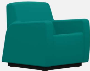
Splash - 225