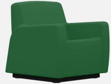
Leaf - 220