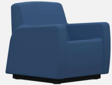
Slate Blue - 426