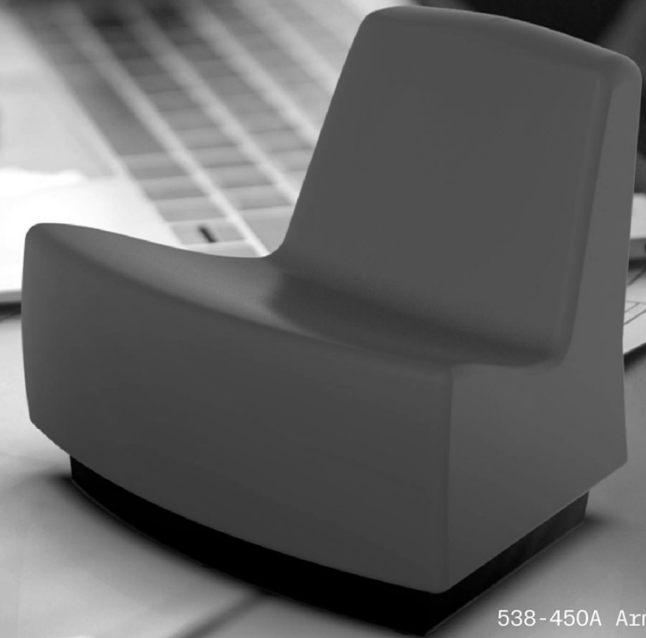
538-450A Armless Chair

Reduced ligature. Check. Soft corners. Check. No seams. Check. Weighted base. Check. Joint Commission happy... check.