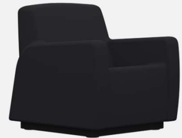
Black - 901