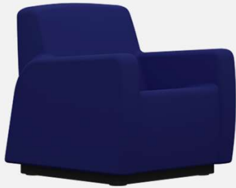
Cobalt - 404