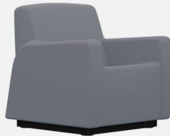
Flannel Grey - 845